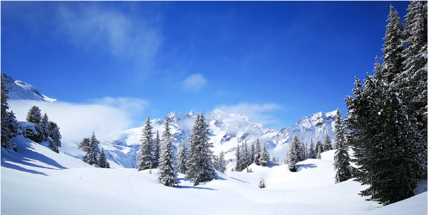
Snowshoeing at Bregenzerwald