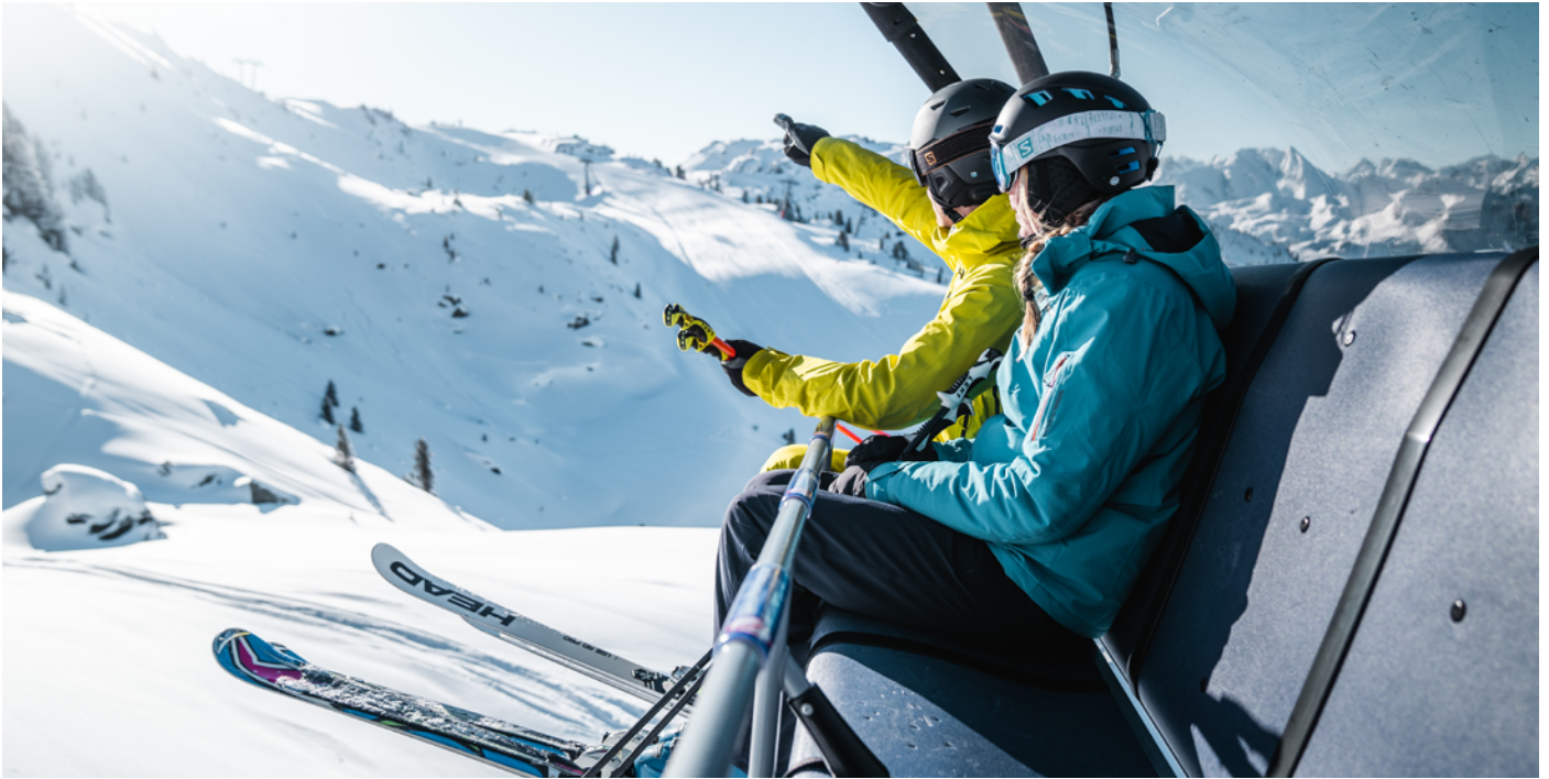
Skiing in the Zillertal Arena