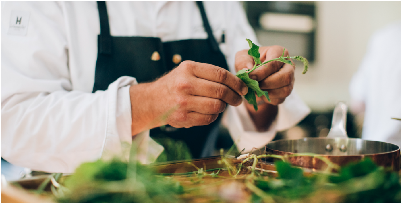
Cooking with herbs