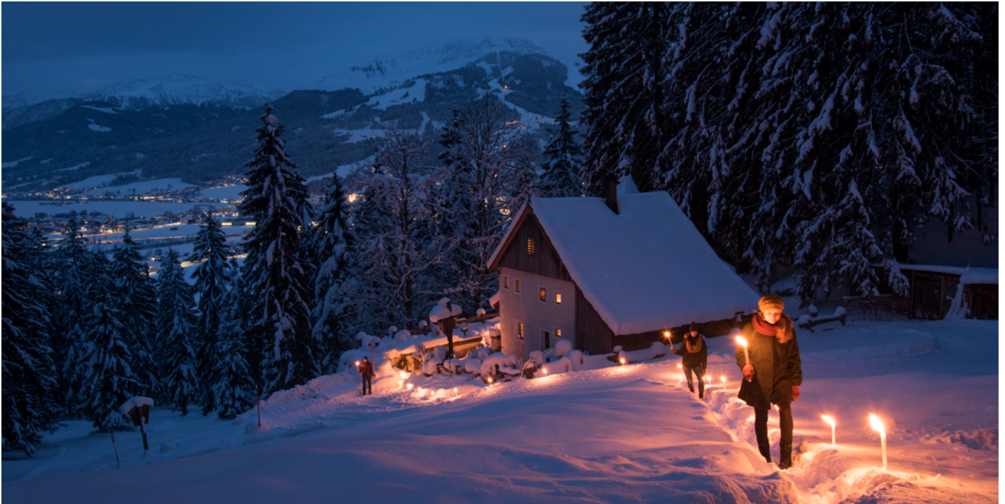
Winter hike to the hermitage region St. Johann in Tirol