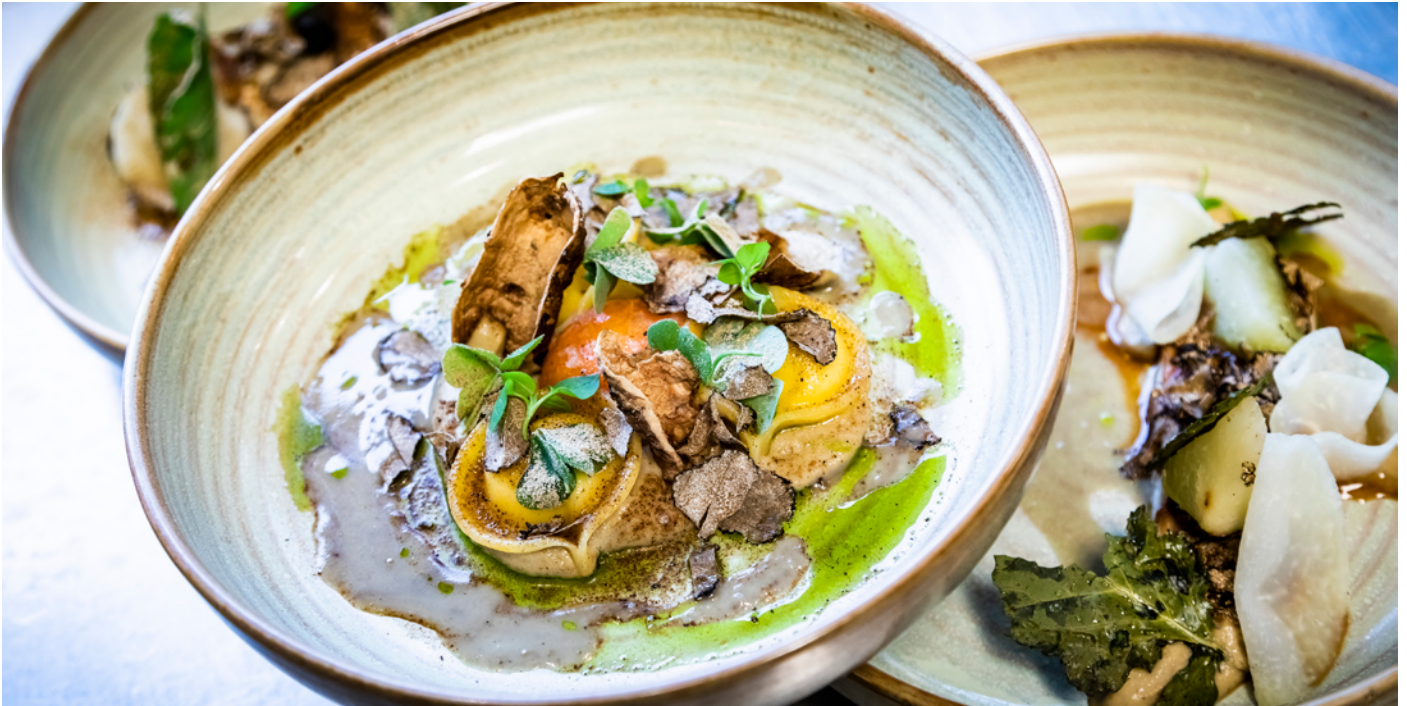
Graz culinary delights in winter