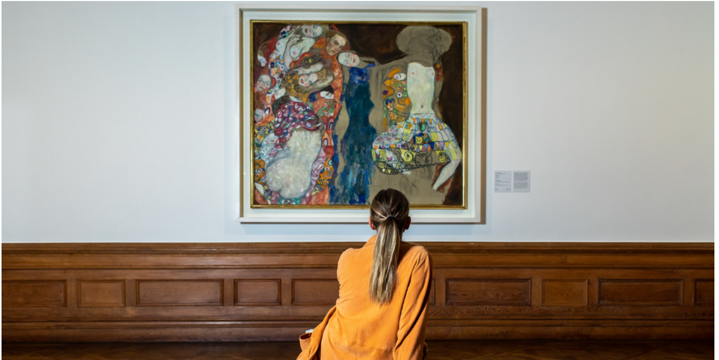
Paintings in the Upper Belvedere Vienna