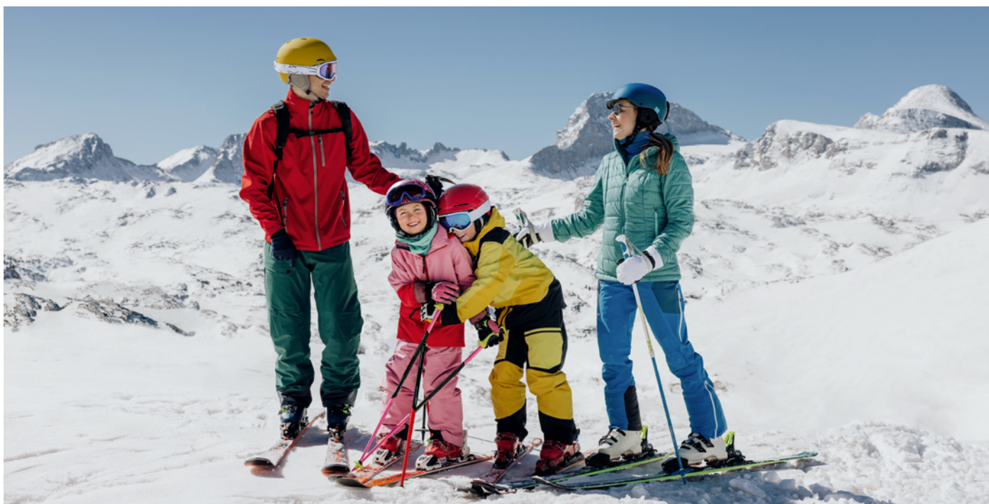
Family skiing at Krippenstein mountain in Obertraun