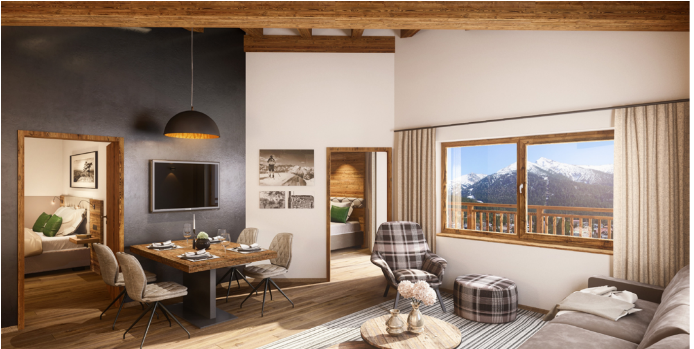
AlpenParks Chalet & Apartment Alpina Seefeld © AlpenParks® Hagan Lodge Altaussee