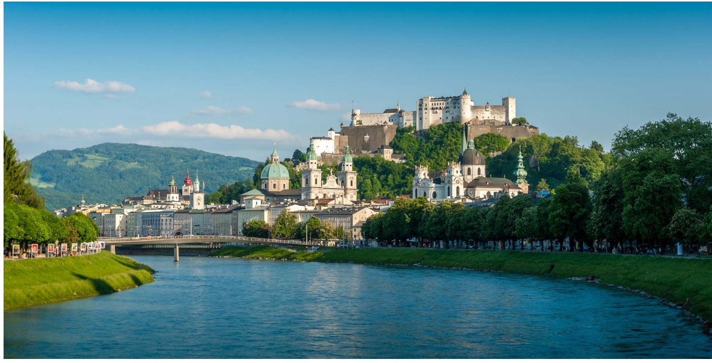
City view Salzburg