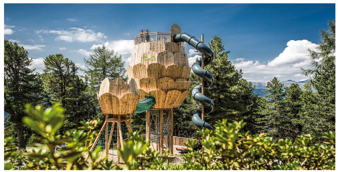
Stone pine park on the Hochzeiger summit in Pitztal