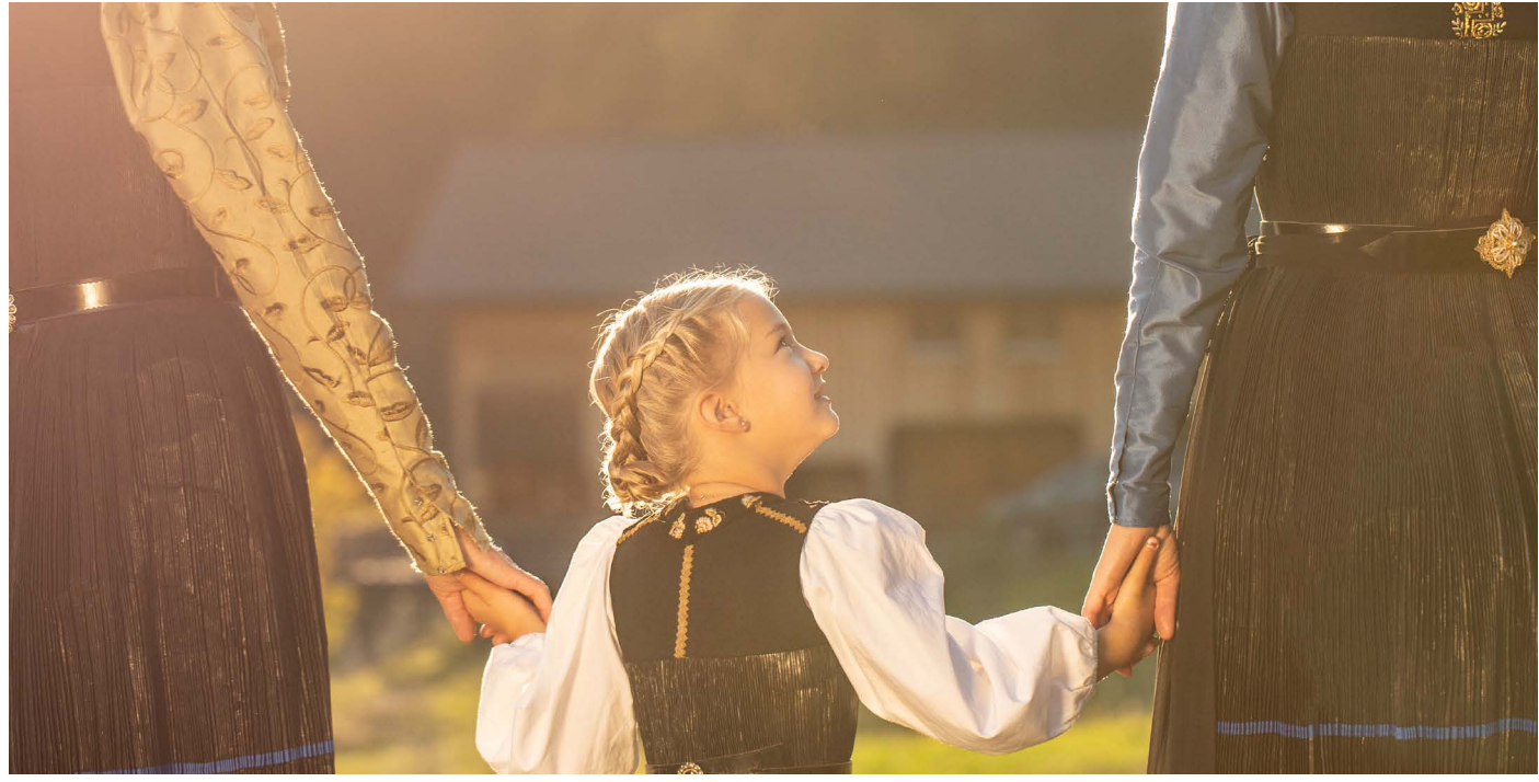
Girl in a traditional costume Bregenzerwald Vorarlberg