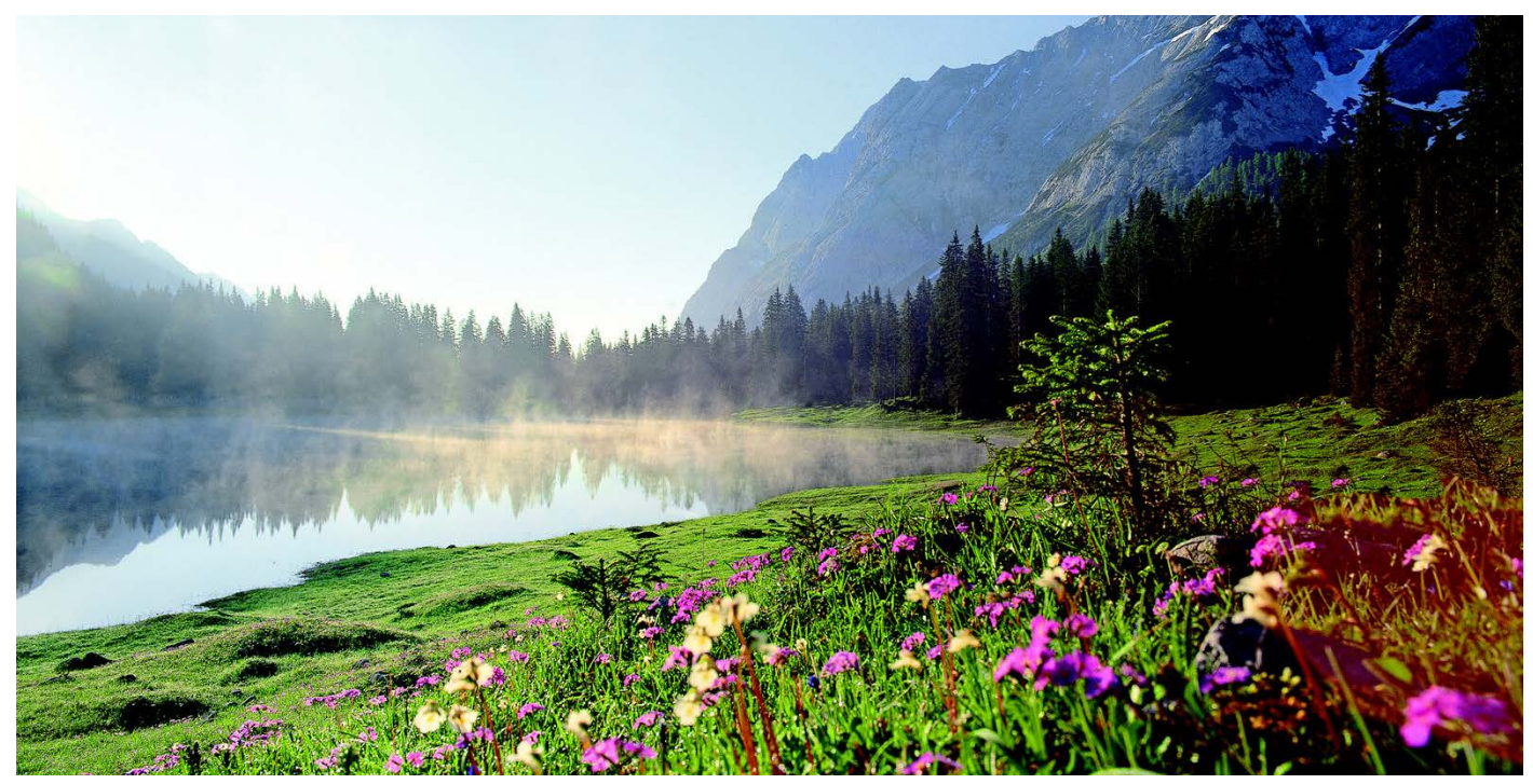
eutasch – Gaistal – Igelsee