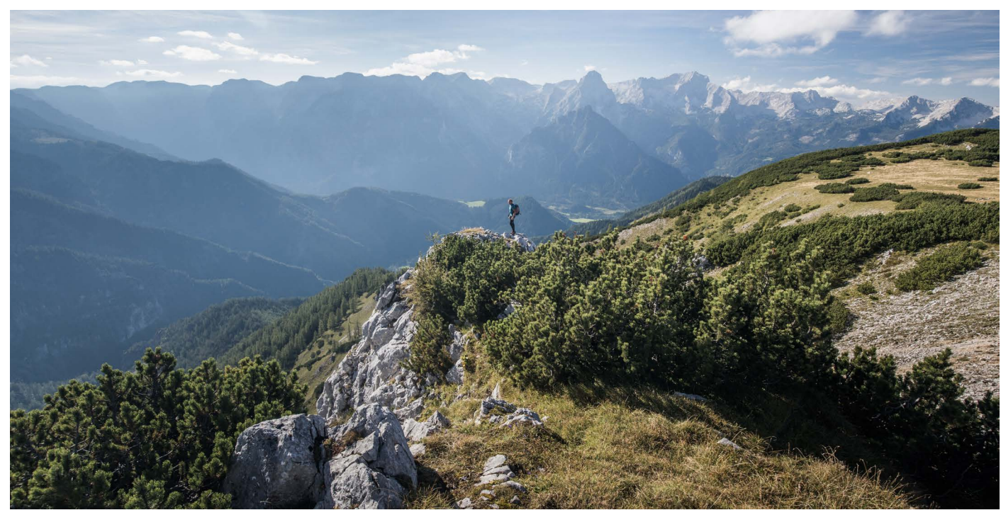
Hiking in the Pyhrn-Priel holiday region in Upper Austria