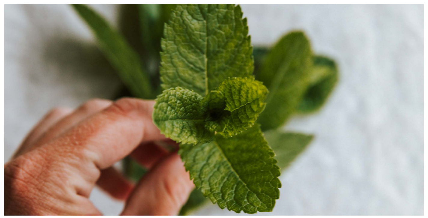
Ginger mint drink