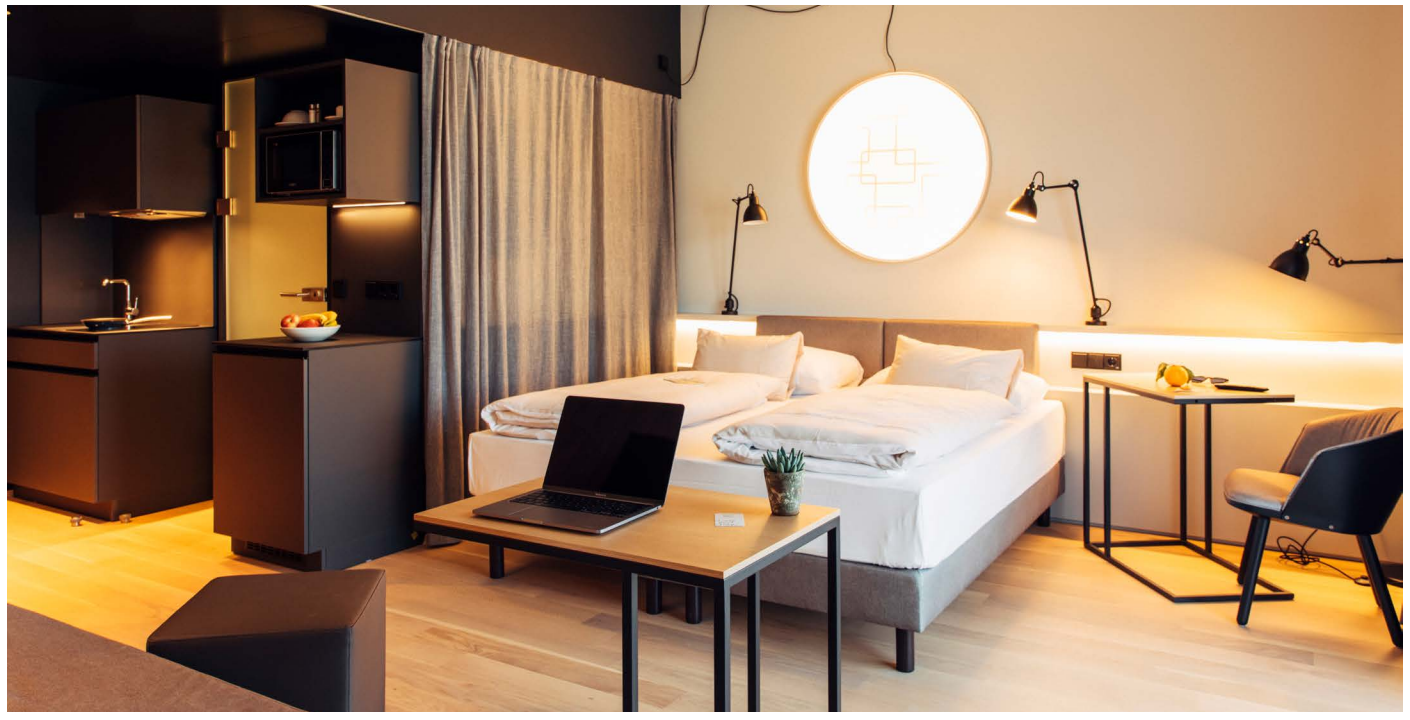
harry's home Studio Business