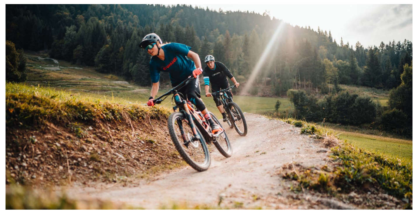
Mountain biking Baumgartnerhöhe