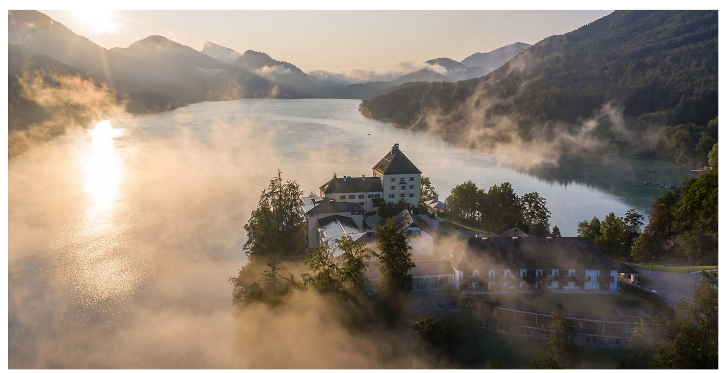
Orone view - Fuschl Castle