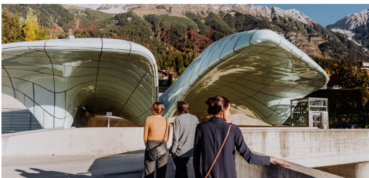
Hungerburg Funicular Innsbruck

The Innsbruck region is much more than its city alone. It also includes 40 towns and villages that fulfil your every want and need. You can stay in the alpine countryside, in an idyllic village, in the city centre or at 2,000 metres above sea level. On the Mieming Plateau west of Innsbruck, for example. This sunny area lies on a high mountain plateau with green alpine meadows and secluded groves. It is ideal for golf, leisurely cycling, walking and cross-country skiing.