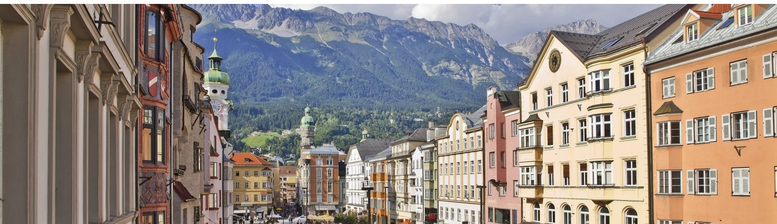
Innsbruck Old Town