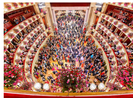
© Österreich Werbung / Andreas Tischler

https://www.austria.info/en-gb/inspiration/ball-season/