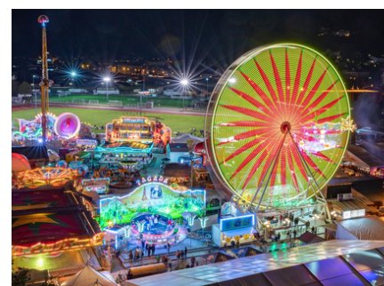
© Stadtgemeinde St. Veit an der Glan

https://www.visitcarinthia.at/destinations/places/st-veit/