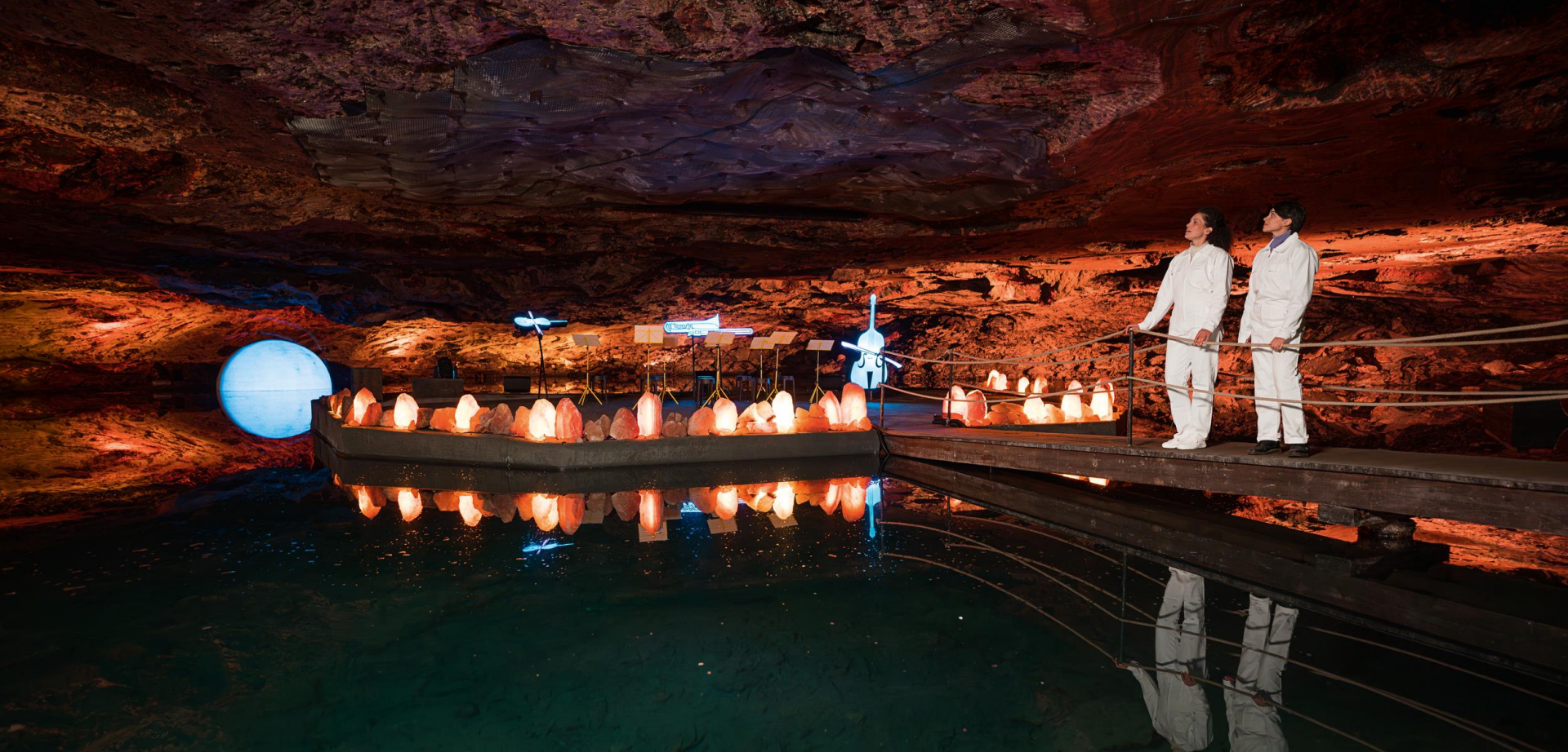
The oldest salt mine in the world, Hallstatt