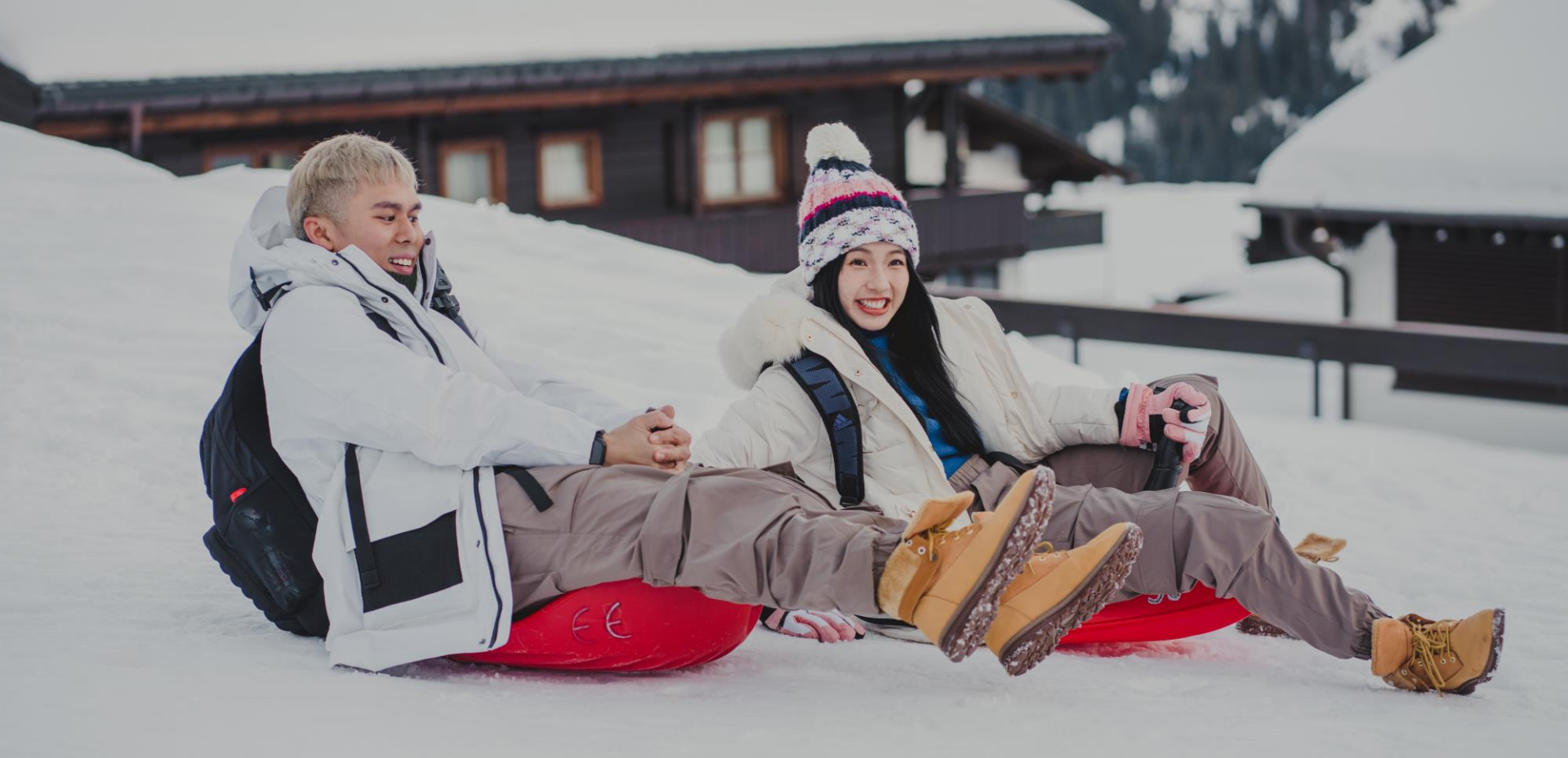
Tobogganing in Oberlech