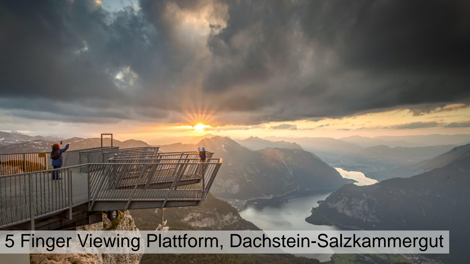
5 Finger Viewing Plattform, Dachstein-Salzkammergut