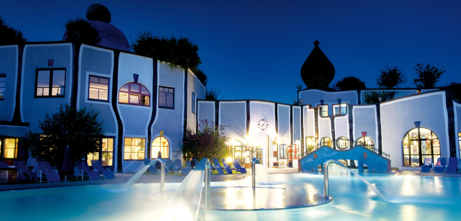
Rogner Therme Bad Blumau, Styria