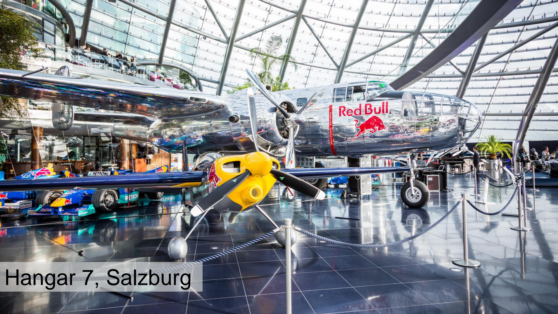
Hangar 7, Salzburg