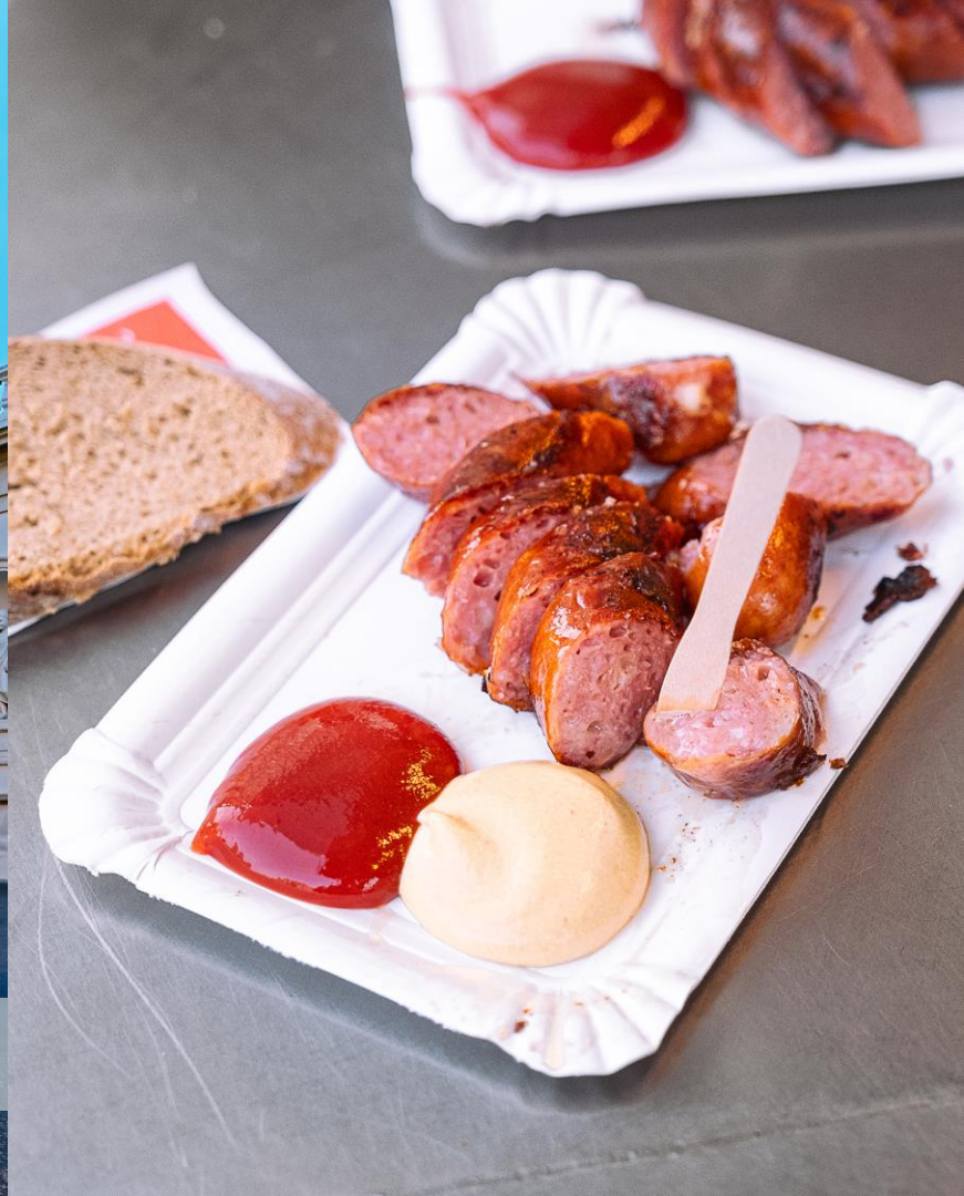
Würstelstand – Sausage Stalls