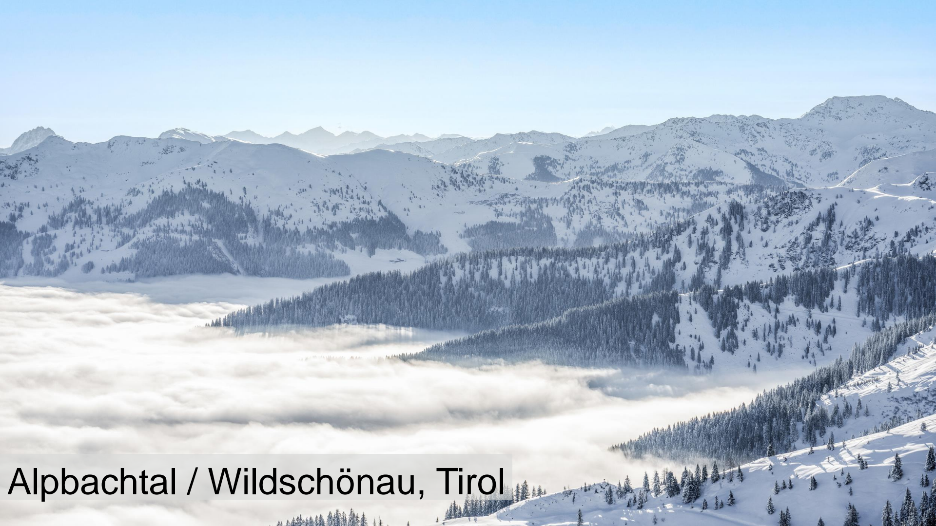
Alpbachtal / Wildschönau, Tirol