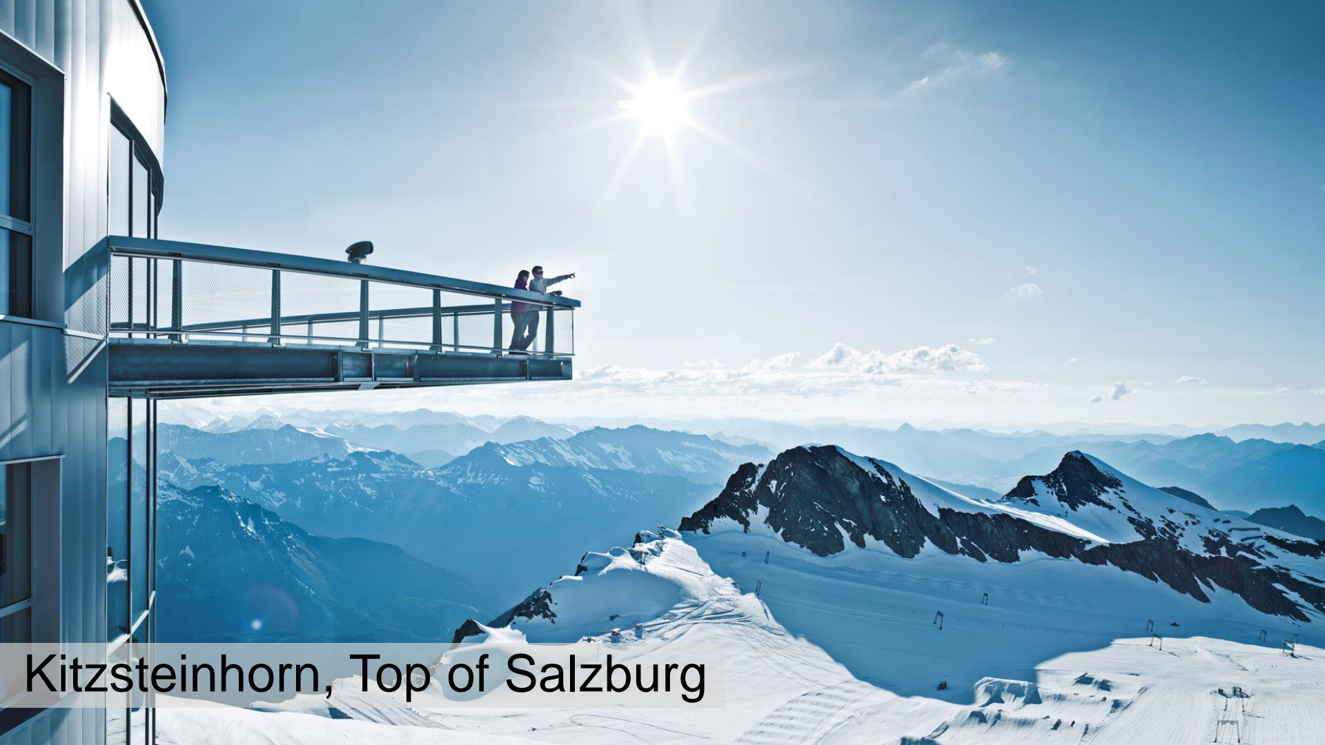
Kitzsteinhorn, Top of Salzburg