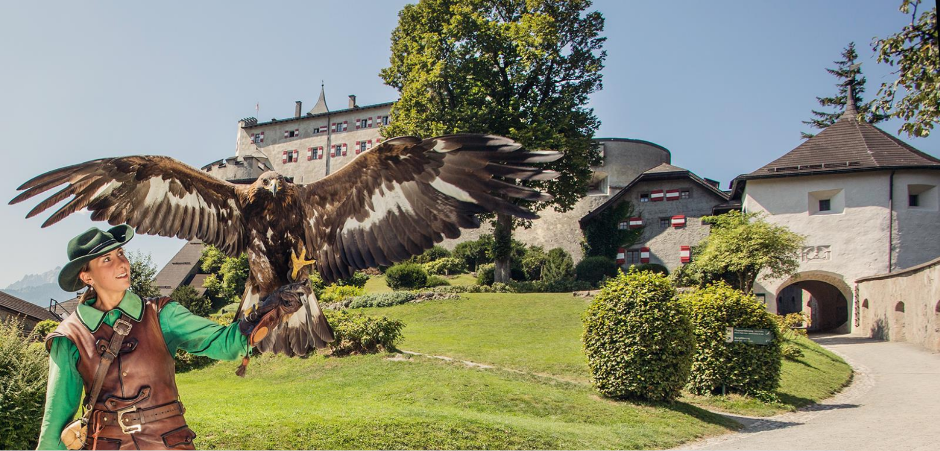
Falconry at Hohenwerfen Fortress, Salzburgerland