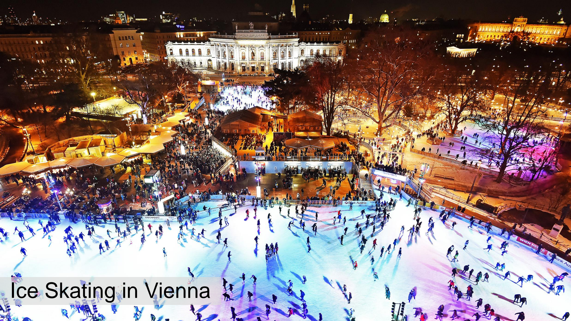
Ice Skating in Vienna