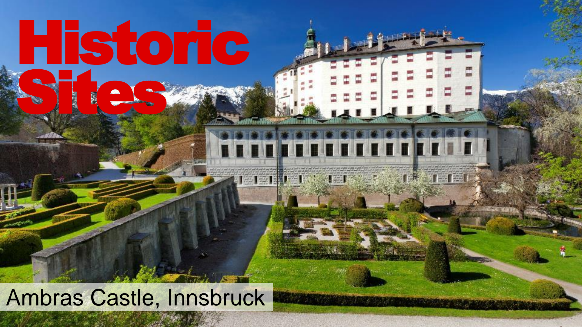
Ambras Castle, Innsbruck