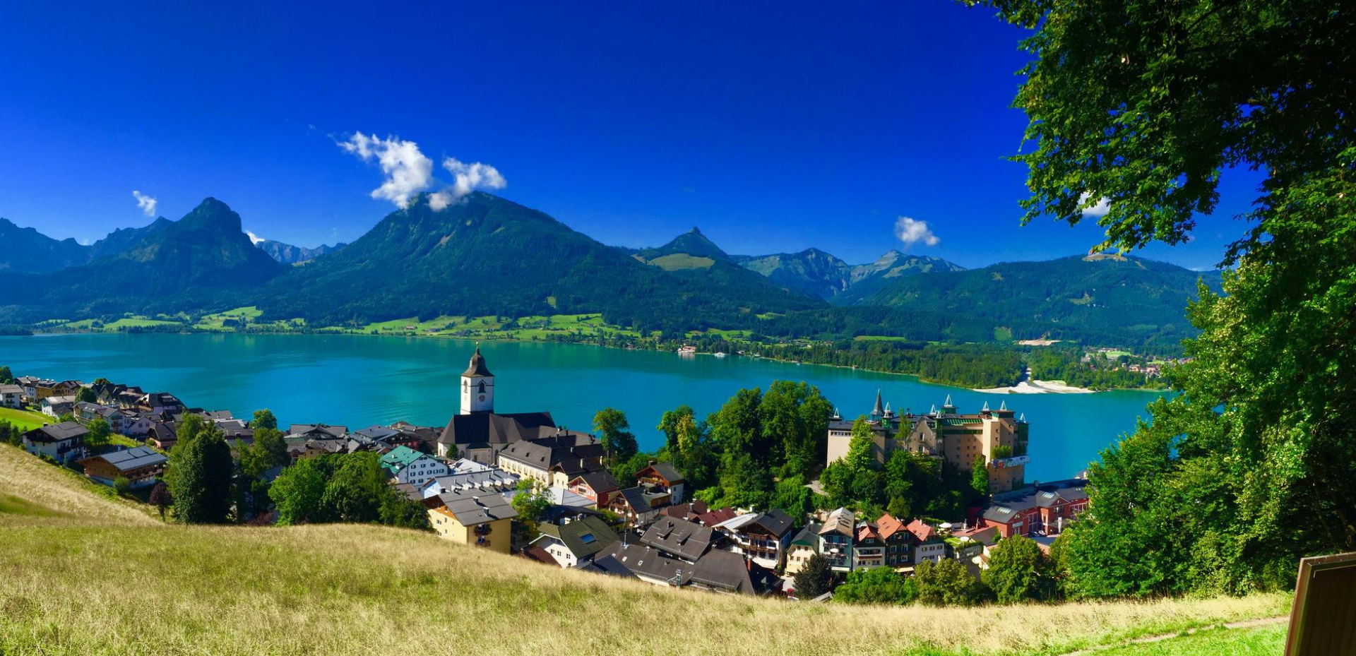
St. Wolfgang, Salzammergut