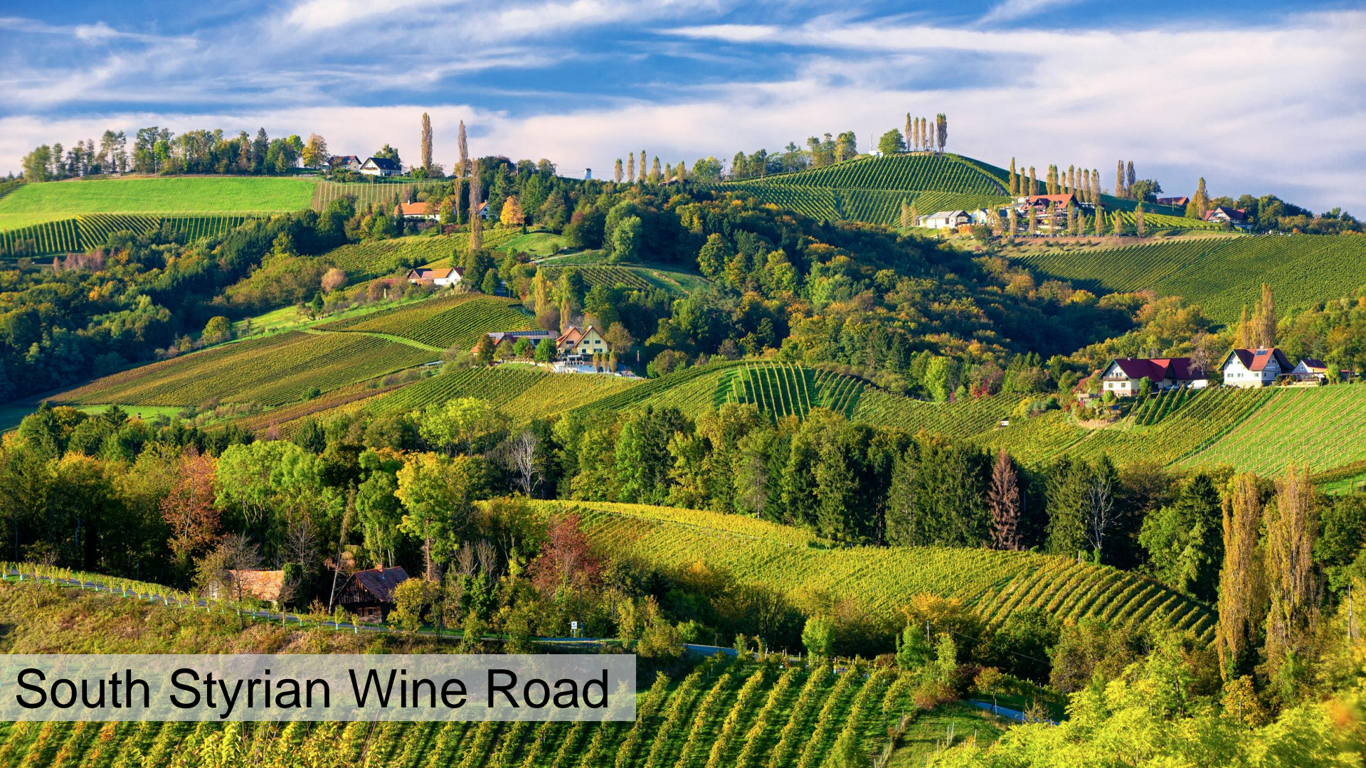
South Styrian Wine Road