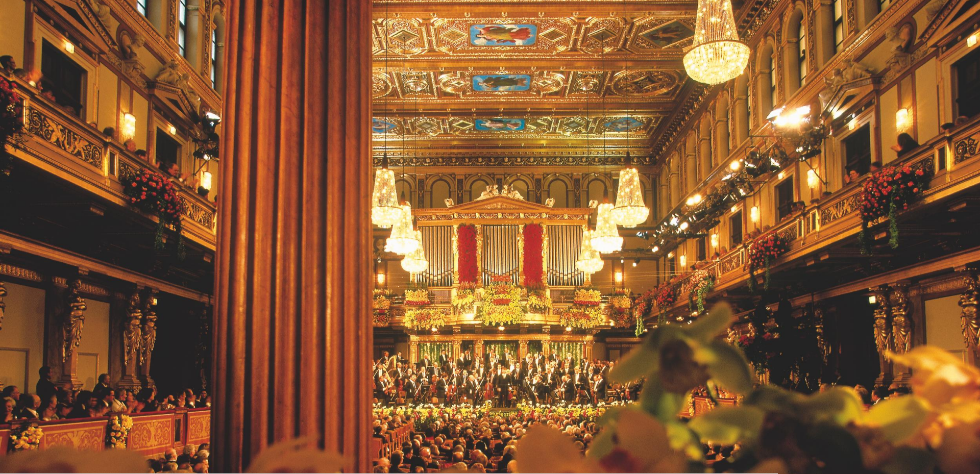
New Year's Concert in Vienna's Musikverein