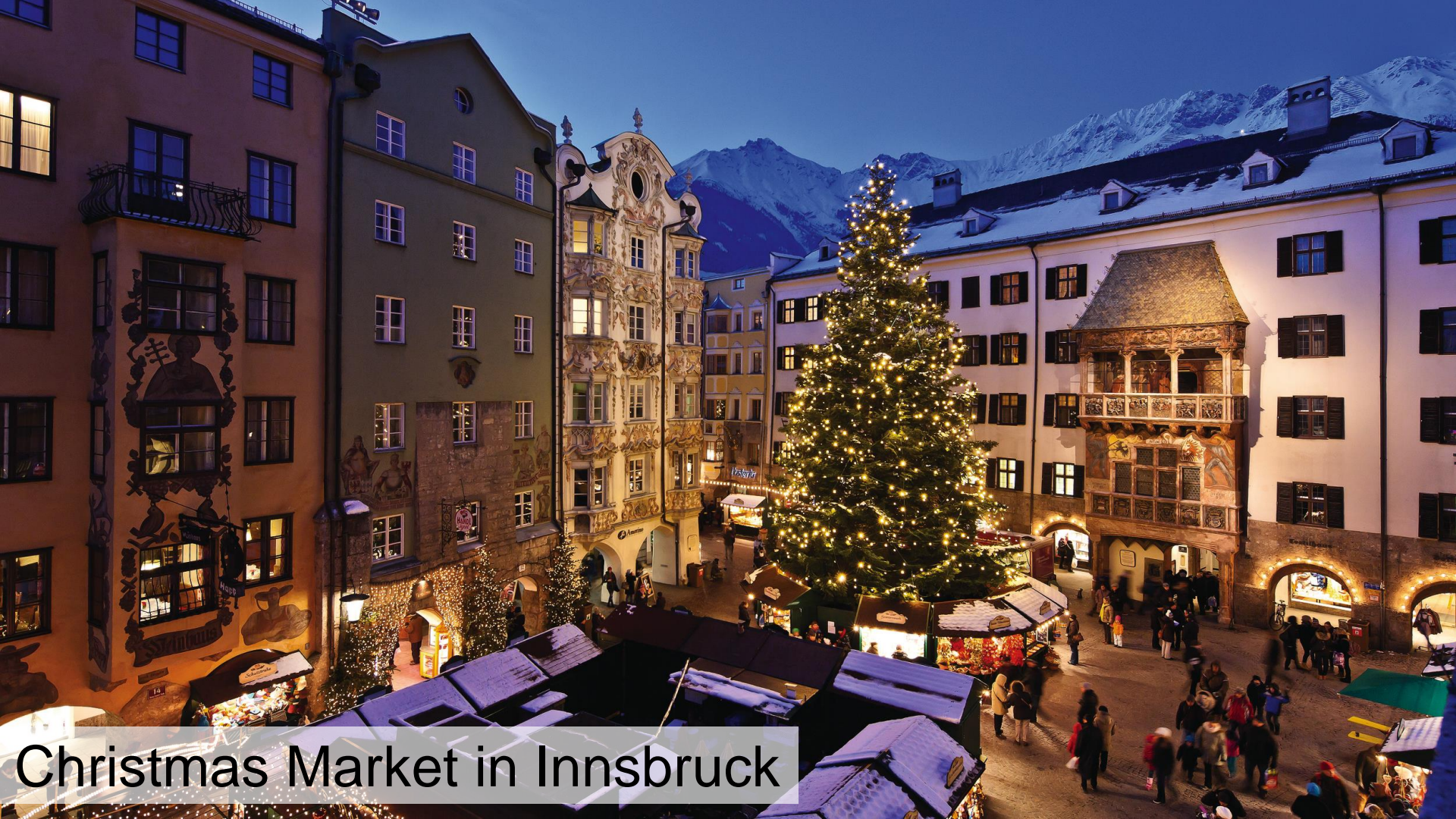
Christmas Market in Innsbruck