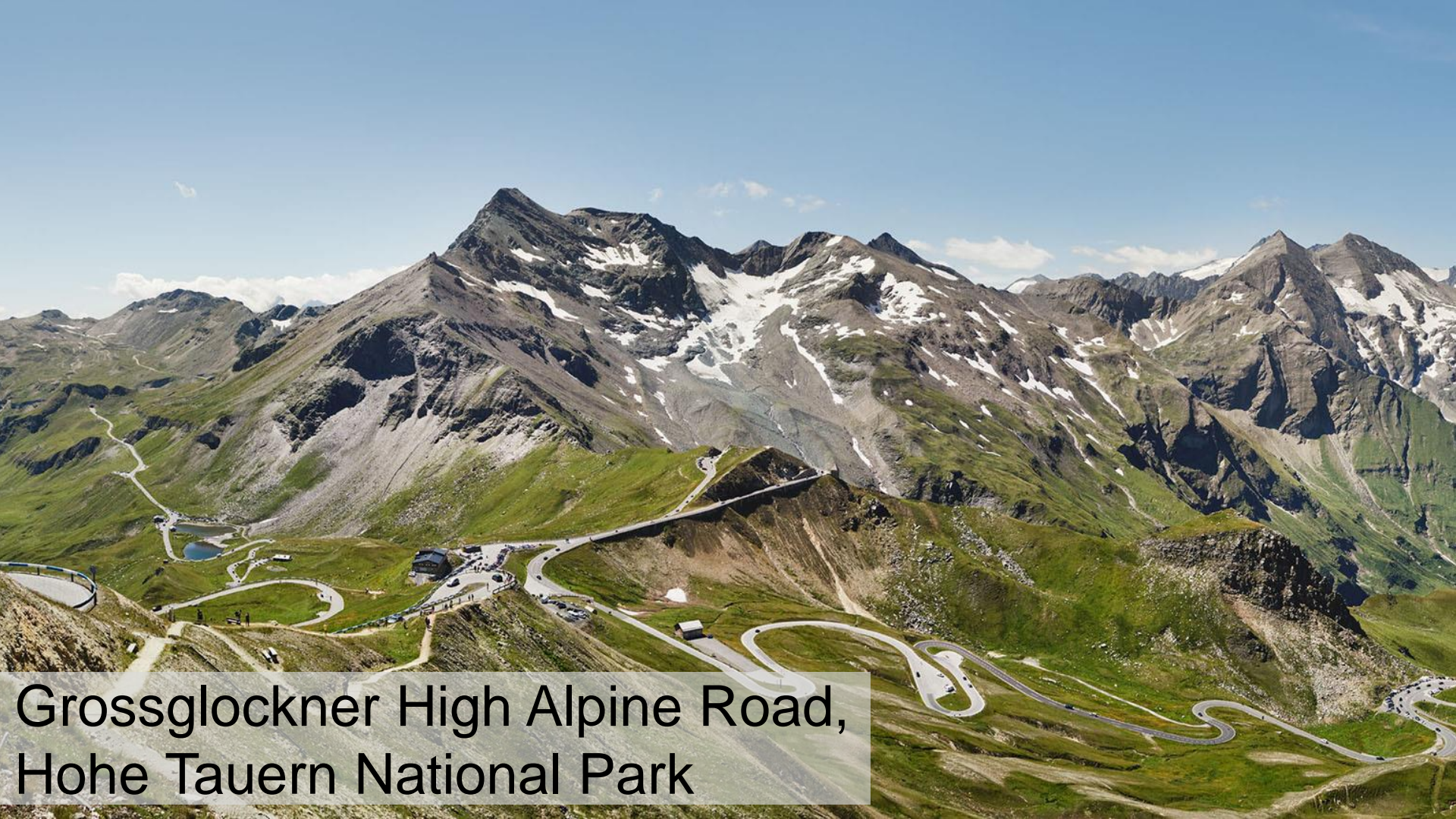
Grossglockner High Alpine Road, Hohe Tauern National Park