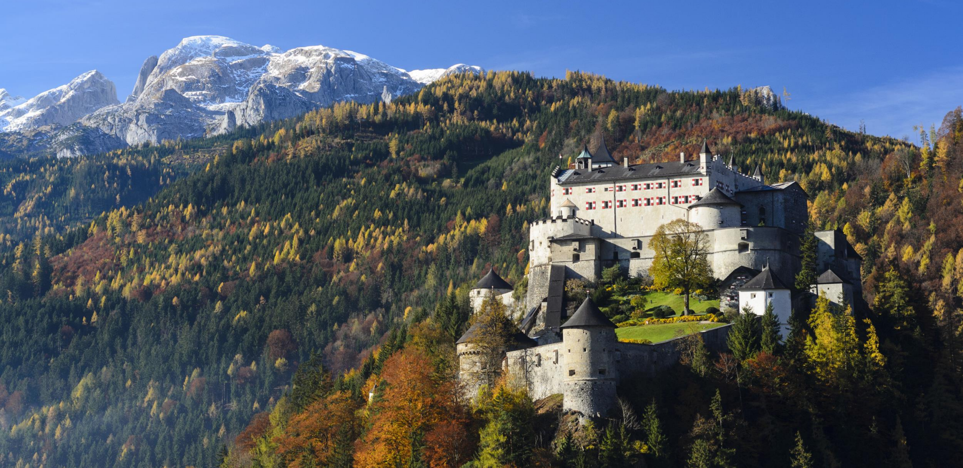
Fortress Hohenwerfen, Salzburgerland