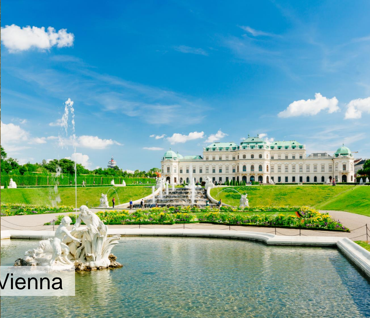
Belvedere Palace, Vienna