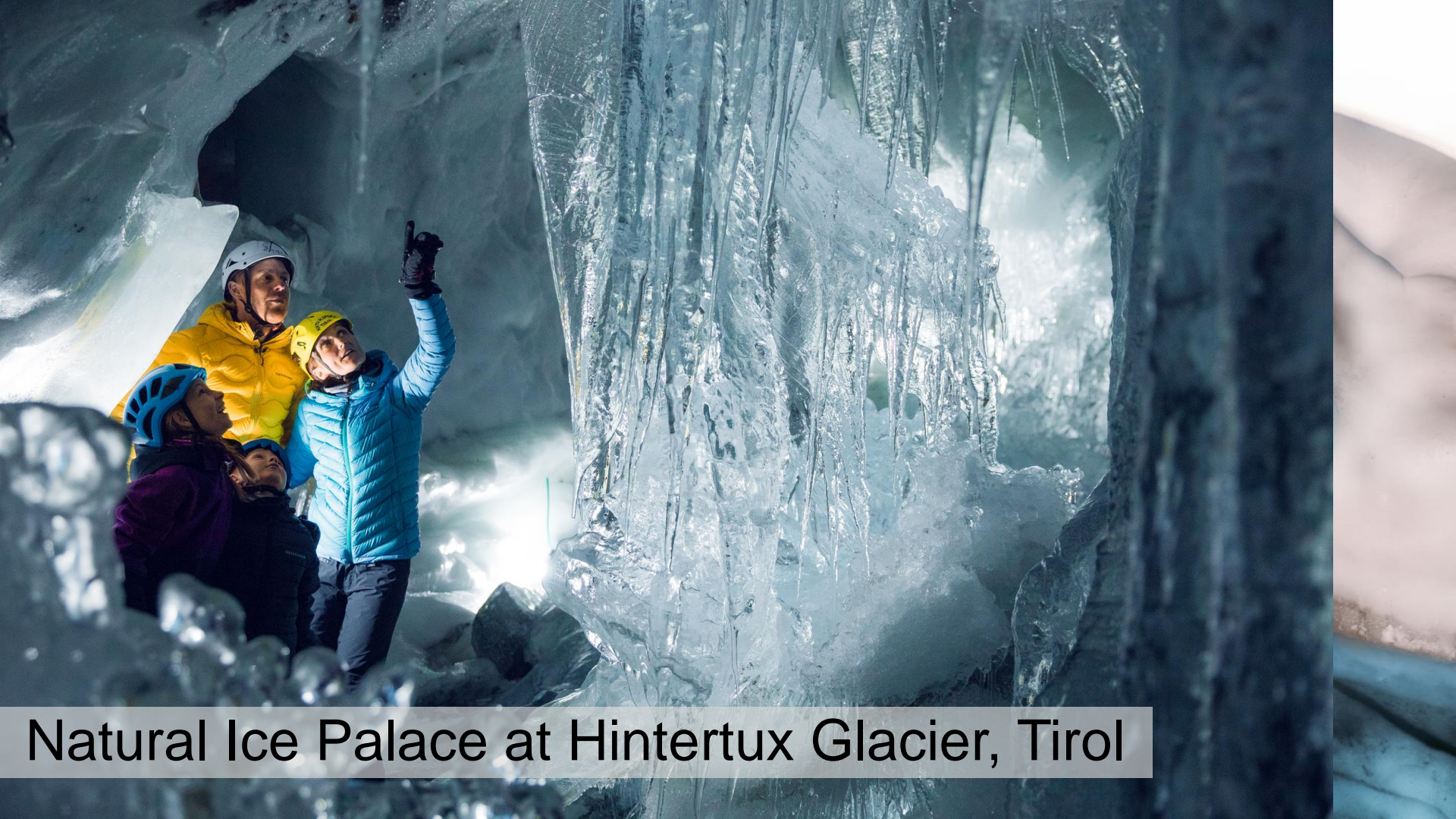
Natural Ice Palace at Hintertux Glacier, Tirol