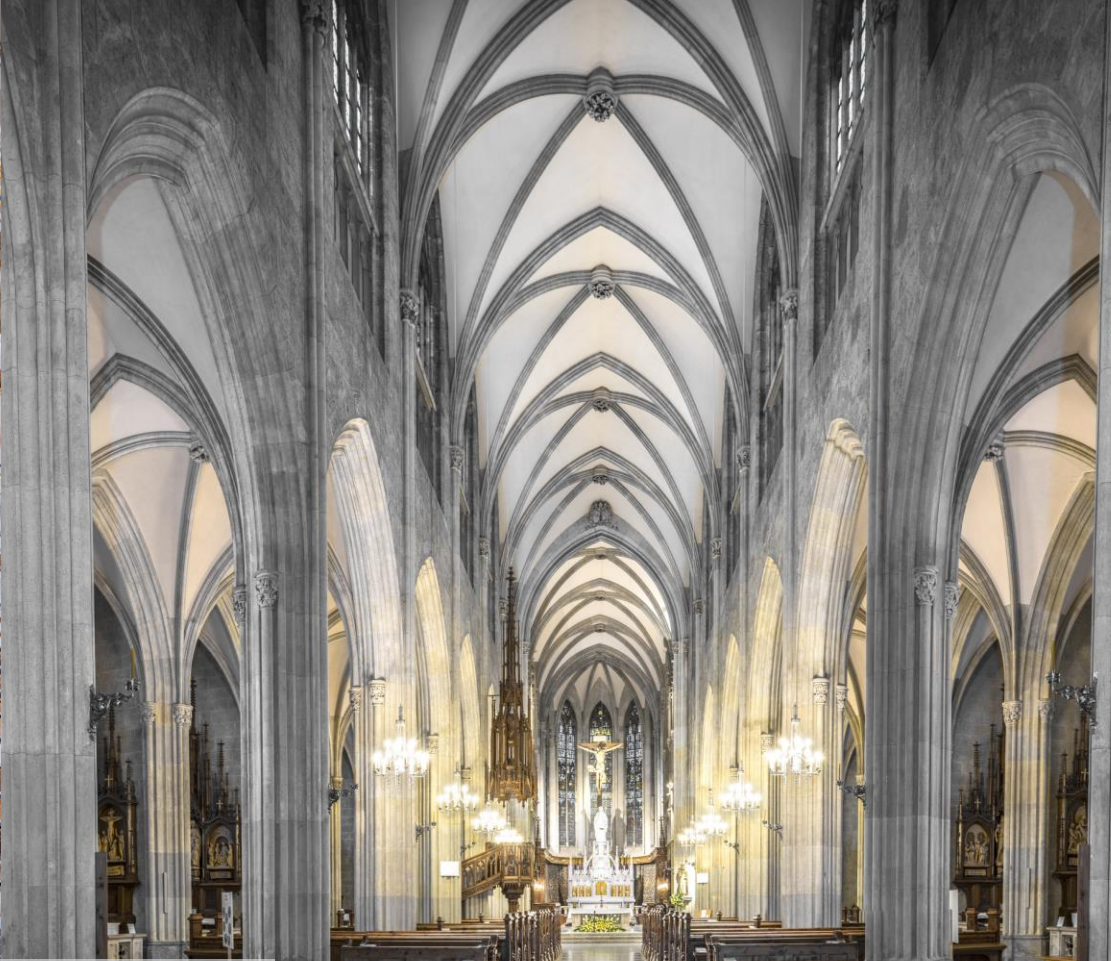
Admont Abbey Monastery, Styria