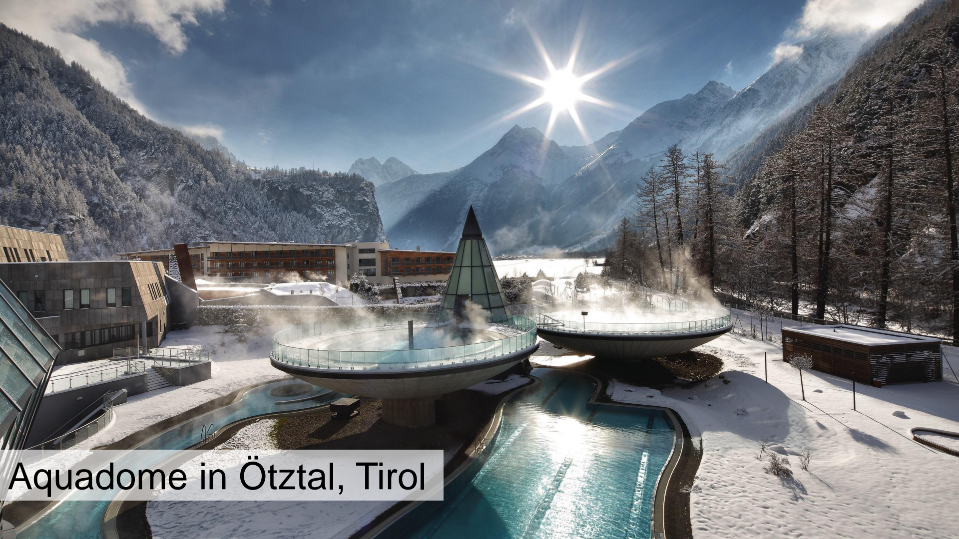
Aquadome in Ötztal, Tirol