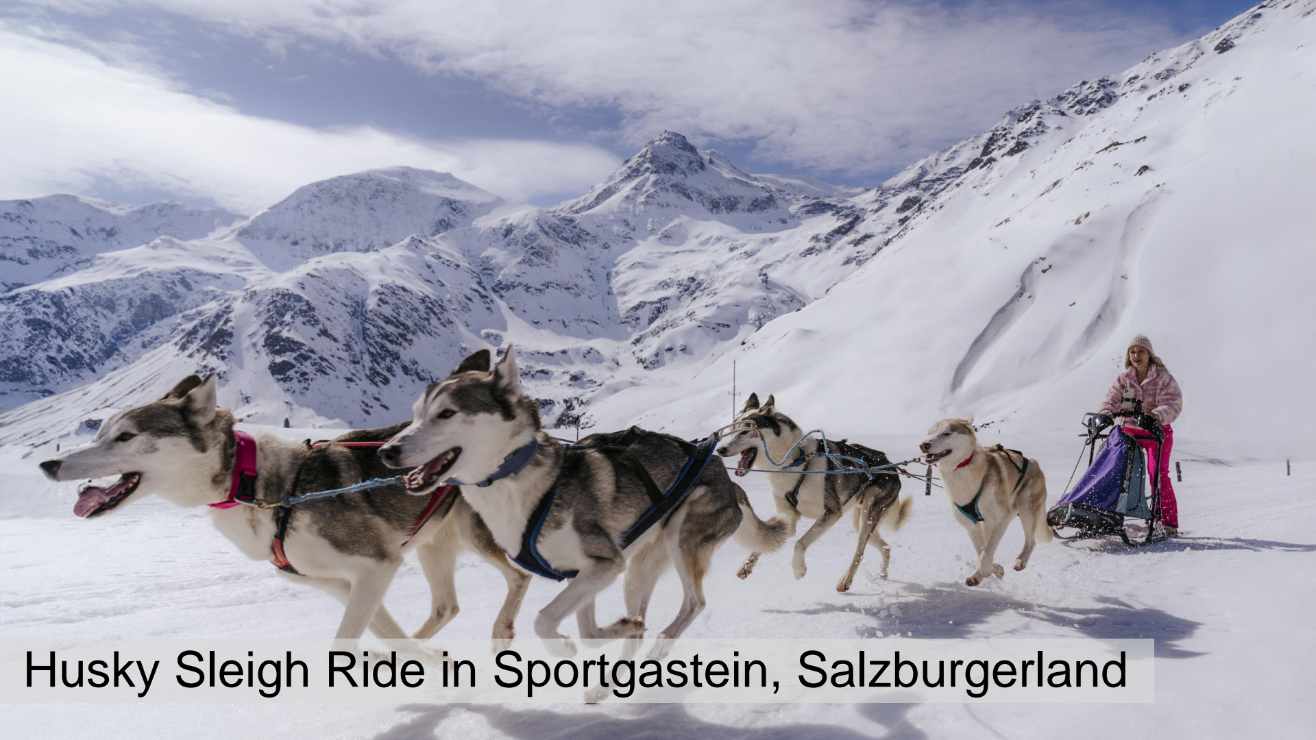
Husky Sleigh Ride in Sportgastein, Salzburgerland