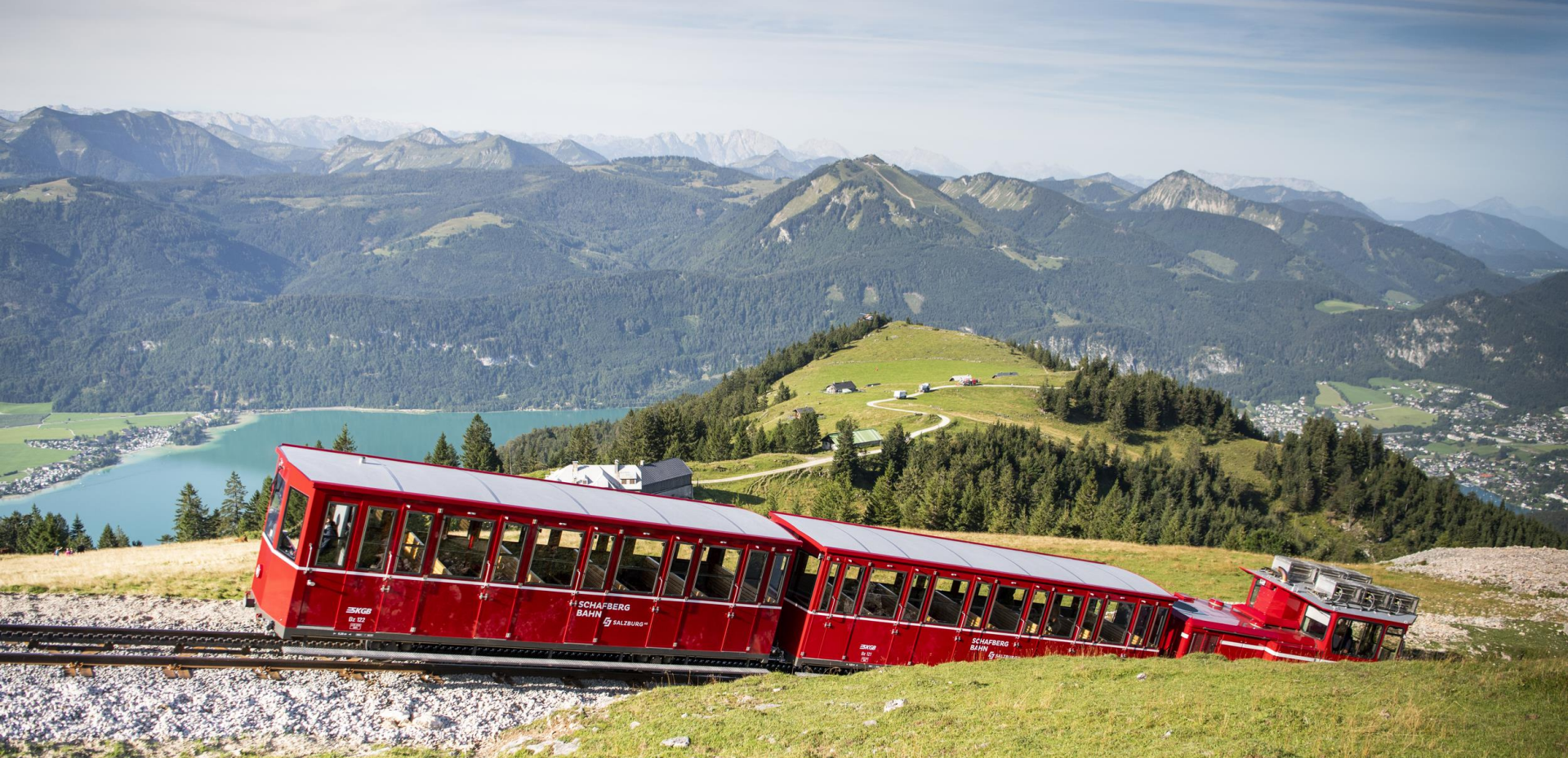
Schafberg Mountain, Wolfgangsee, Salzammergut