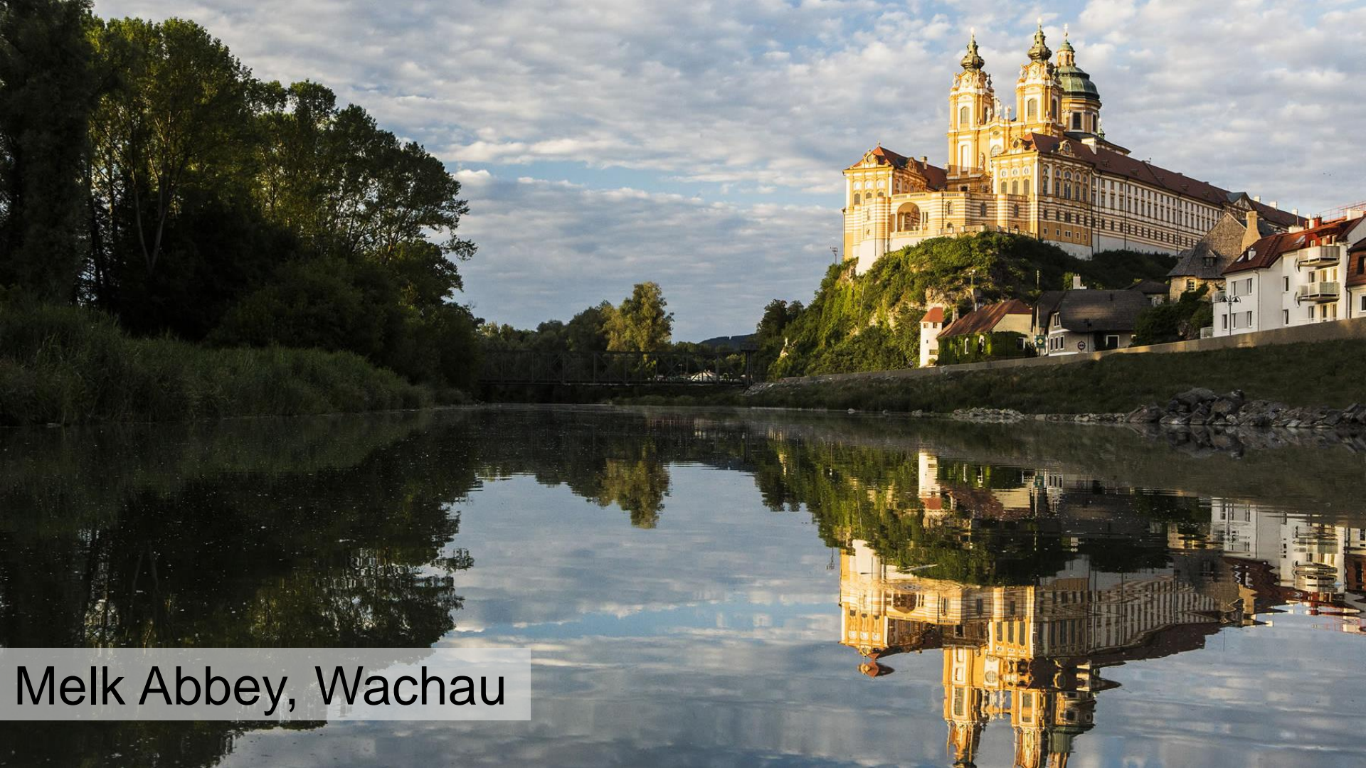
Melk Abbey, Wachau