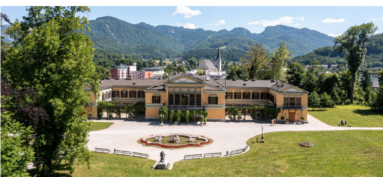
Kaiservilla, Bad Ischl

From Fuschl the route takes you to the spa town of Bad Ischl where Emperor Franz Joseph used to spend his summers. Make sure to visit the Imperial Kaiservilla and have coffee & cake at Zauner Café and Cake Shop . From there, drive deeper into the less-travelled part of the Salzkammergut (lake region) to Altaussee and Grundlsee , two of the smaller lakes in the region.