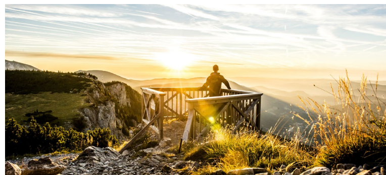
Rax