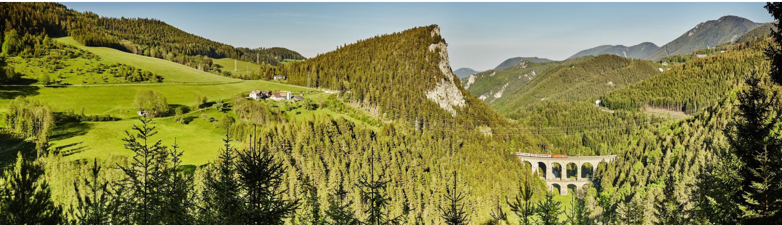
Semmering Railway

Situated just one hour south of Vienna, is the start of the Vienna Alps arc – a spectacular range of summits sprinkled with pretty, cultural villages. The area is connected by the UNESCO world heritage accredited Semmering Railway - Europe's first mountain railway and technical masterpiece (built 1848 – 1854). The core route from Gloggnitz to Mürzzuschlag includes 15 tunnels, 16 viaducts and 100 arched bridges, and overcomes 459 meters in altitude.