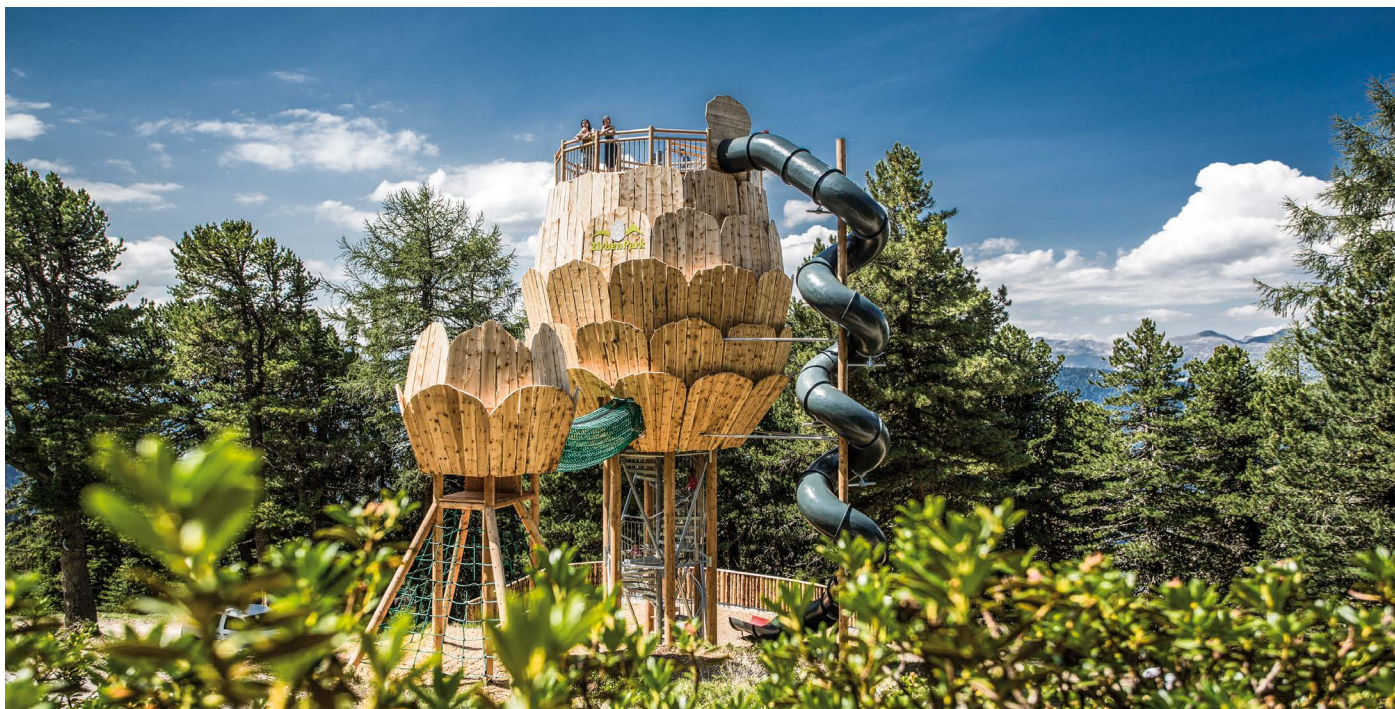
Stone pine park on the Hochzeiger summit in Pitztal