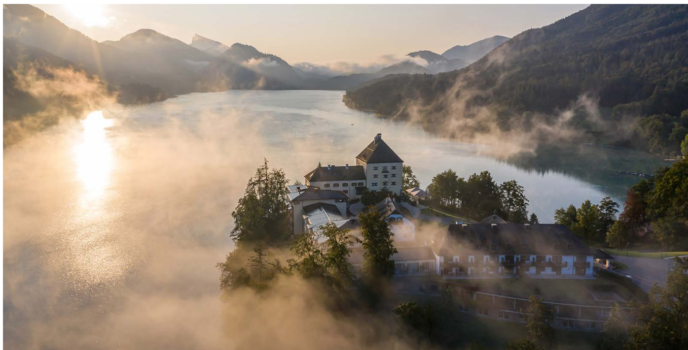
Drone view - Fuschl Castle