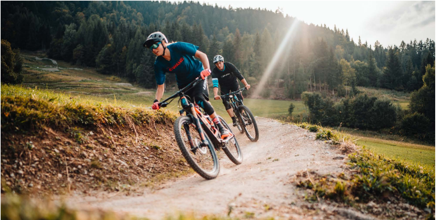
Mountain biking Baumgartnerhöhe