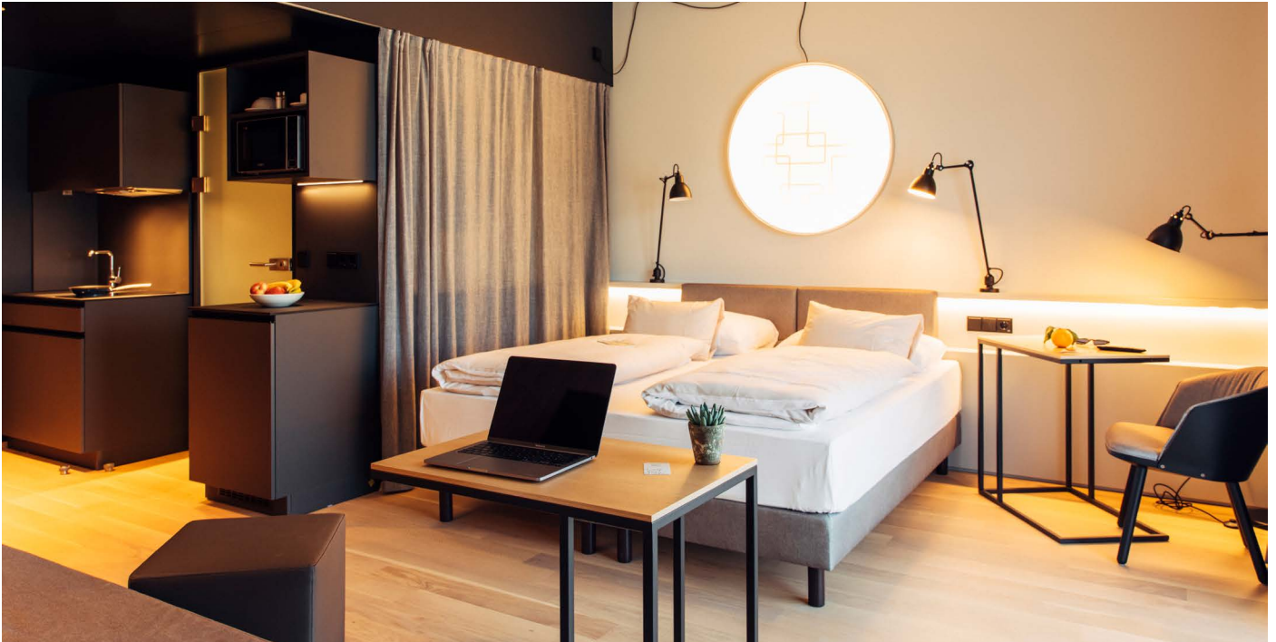
harry's home Studio Business