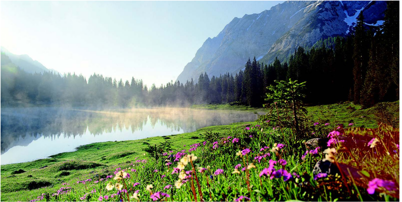
Leutasch – Gaistal – Igelsee