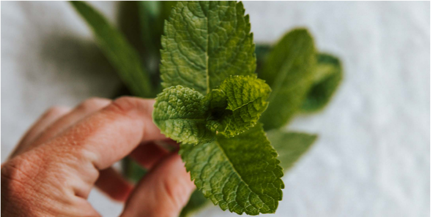
Ginger mint drink