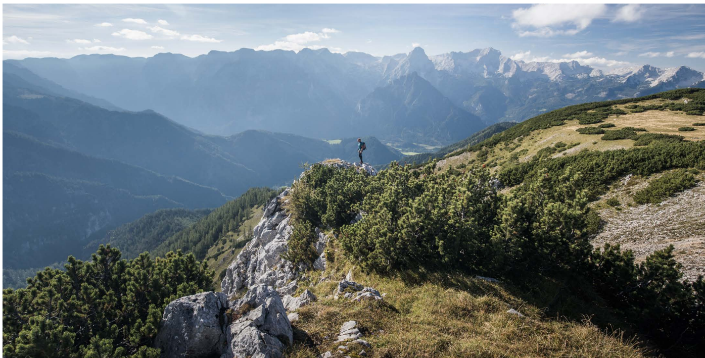
Hiking in the Pyhrn-Priel holiday region in Upper Austria