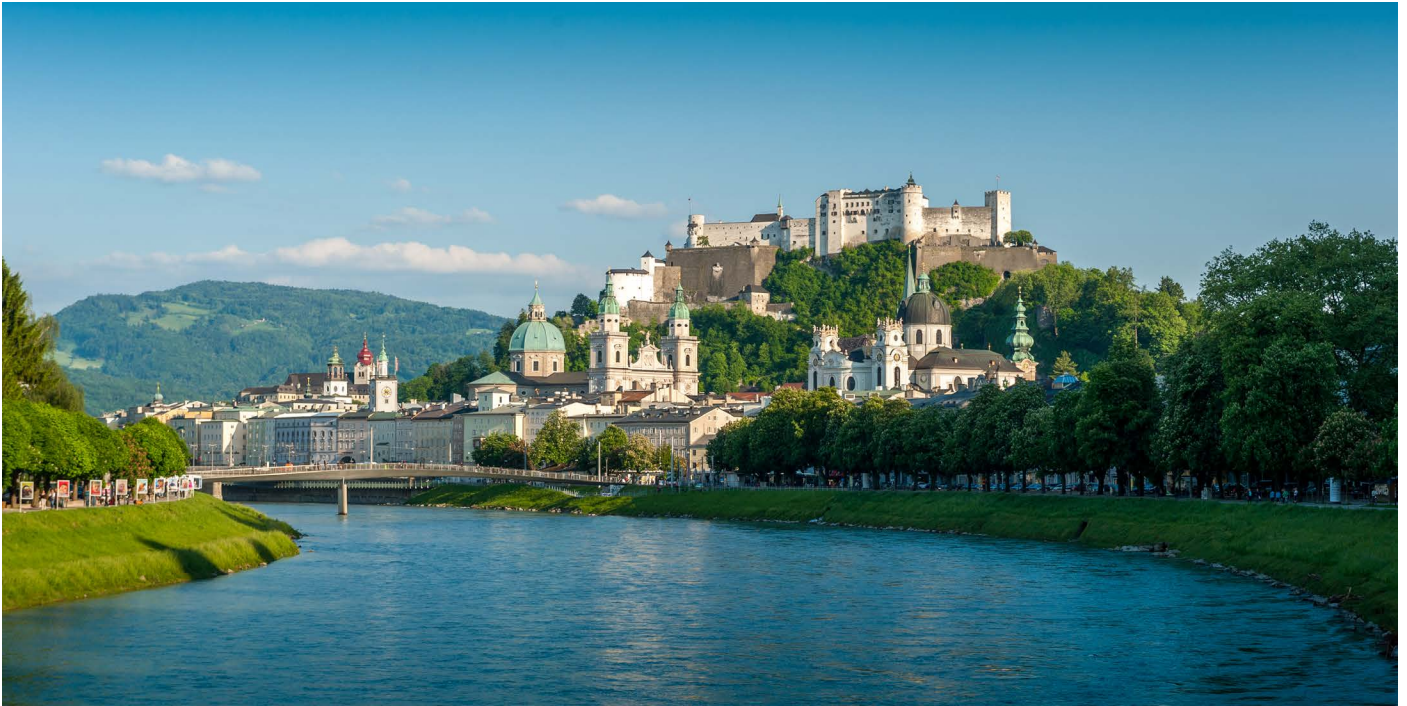
City view Salzburg