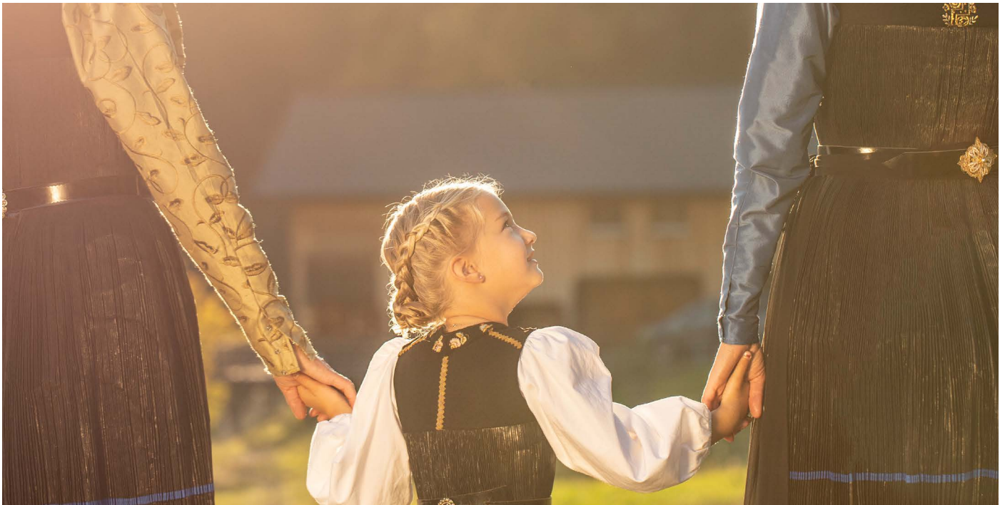
Girl in a traditional costume Breitenwand Vorarlberg