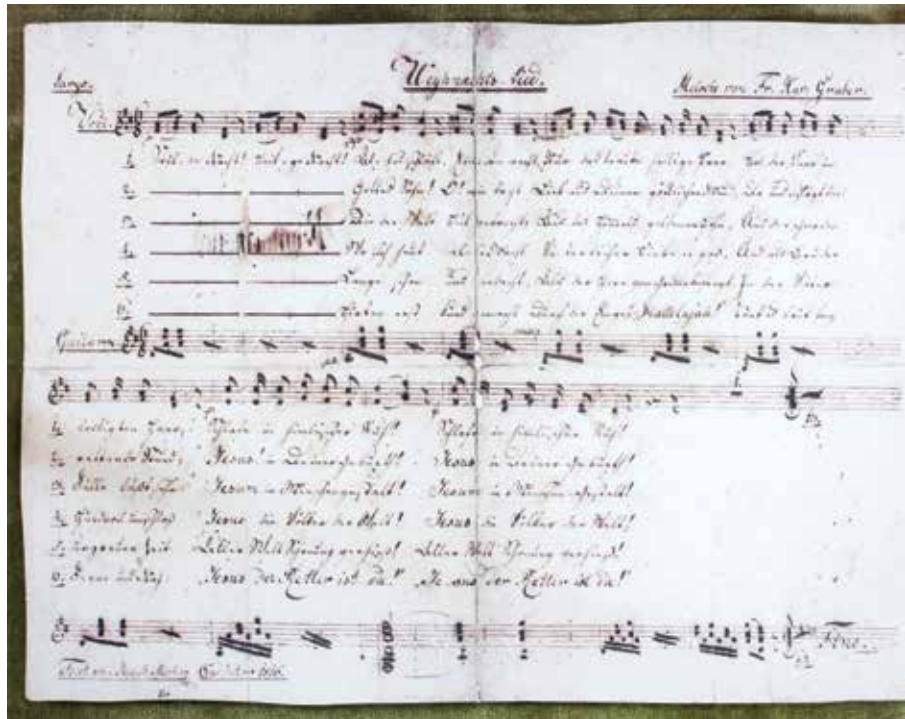
Silent night autograph

Oberndorf – visit the Silent Night Chapel and the Museum in the old vicarage with a focus on Silent Night and the Salzach river shipping. Continue on to the City of Salzburg (approx. 20km), walk in the footsteps of Silent Night through the City of Salzburg and visit the special exhibition "Silent. Night. 200." in the Salzburg Museum, as well as the stage play "Silent Night Story" composed by John Debney at the stage "Felsenreitschule".