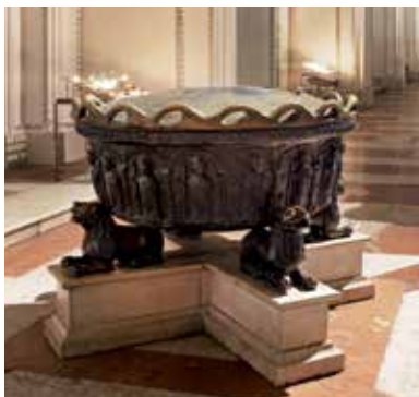
Salzburg – Baptismal font