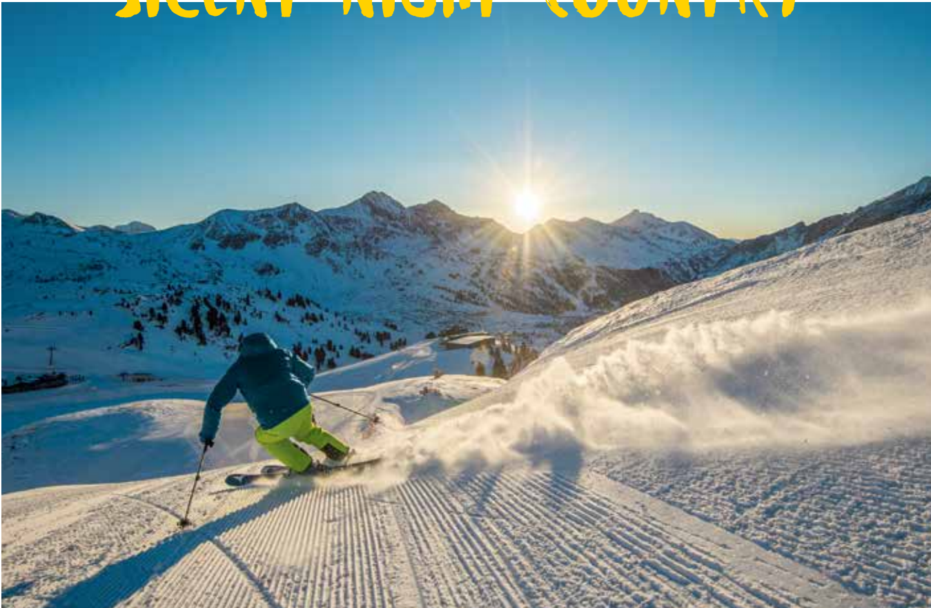
Obertauern – skiing

A visit to the Silent Night towns combines well with adventure rich winter activities: