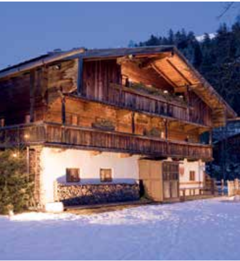
Achensee – Sixenhof