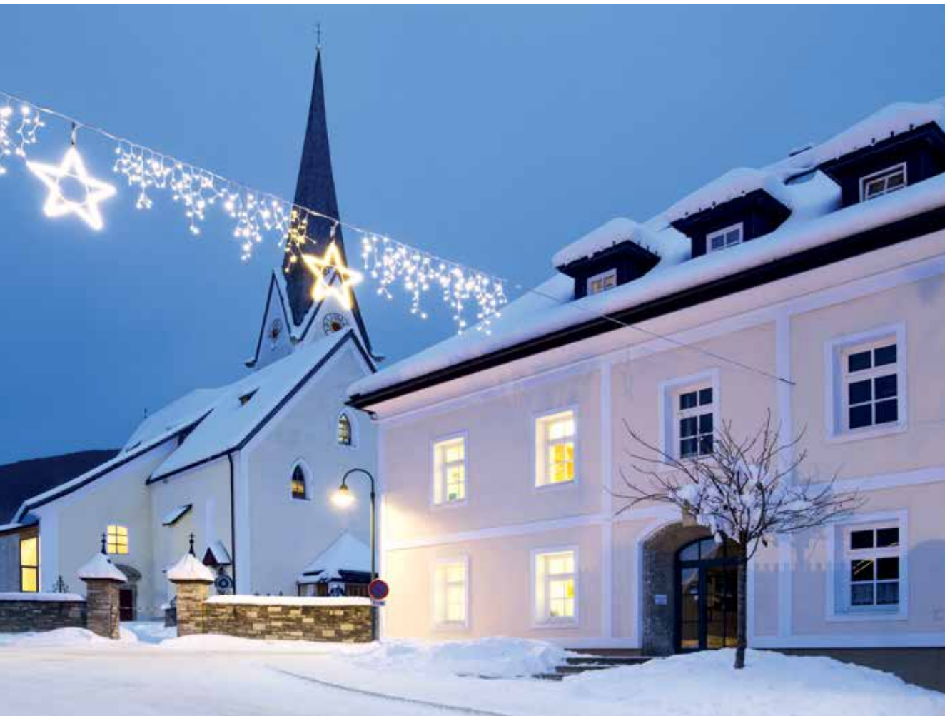
Wagrain – Church, grave from Mohr and Joseph Mohr school