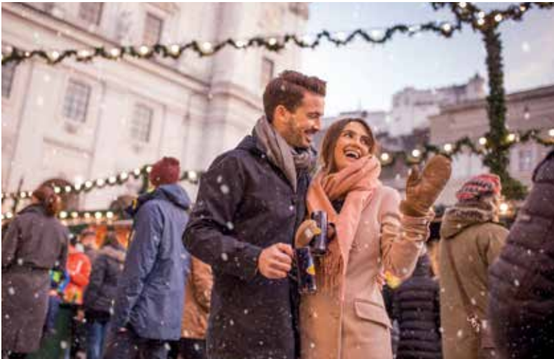
Salzburg Christmas market