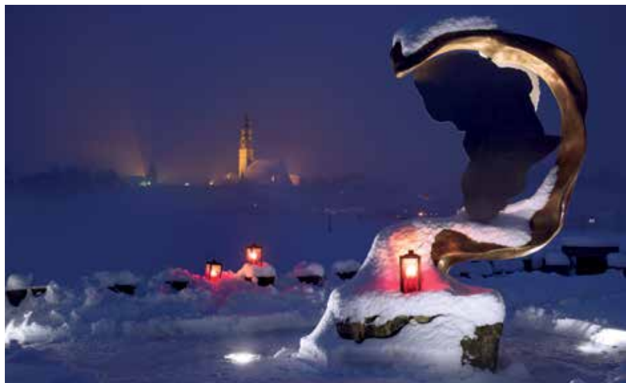
Hochburg-Ach – peace path

Ried im Innkreis – here in 1806 Franz Xaver Gruber completed his apprenticeship. As in many cities of the Innviertel region, the centre of Ried is characterised by typical Bavarian Baroque facades. Not until 1779, did Ried and the Innviertel come to Upper Austria. In Napoleonic times, it changed hands several times between Bavaria and Upper Austria.