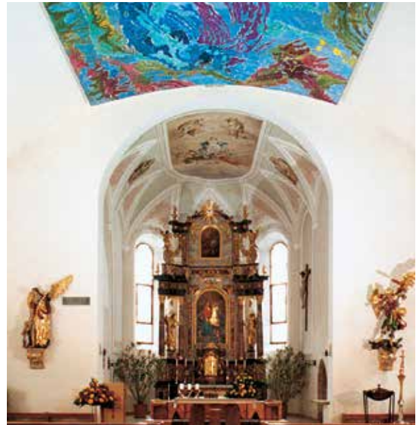
Mayrhofen – Parish Church