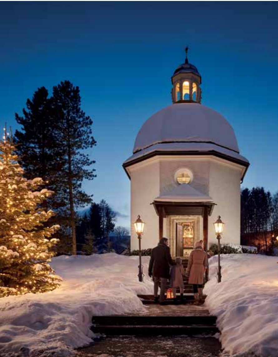
Oberndorf – Silent night chapel