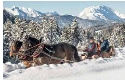
Horse-drawn sleigh ride

Snow-shoe hiking, cross-country skiing, winter hiking, ice skating - there are countless ways to enjoy the winter.