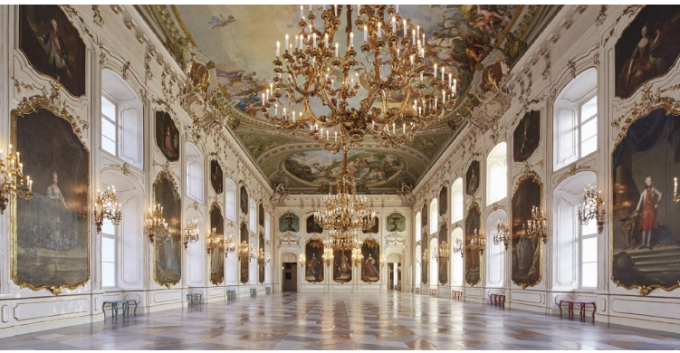
Imperial Palace