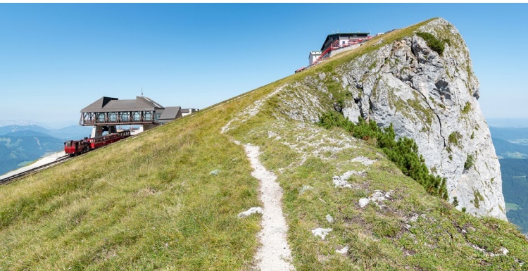
Schafberg Mountain