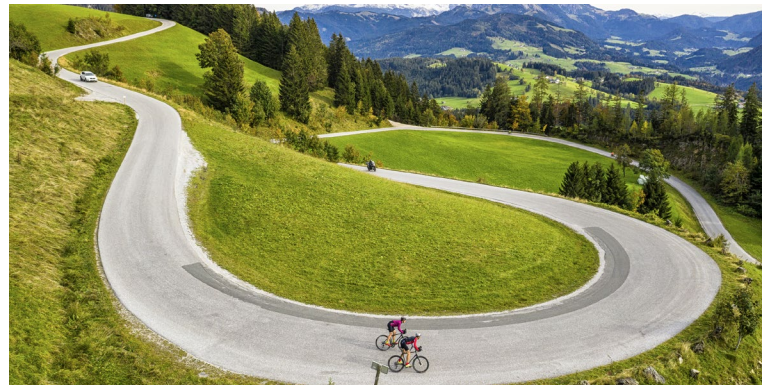
Postalmstrasse